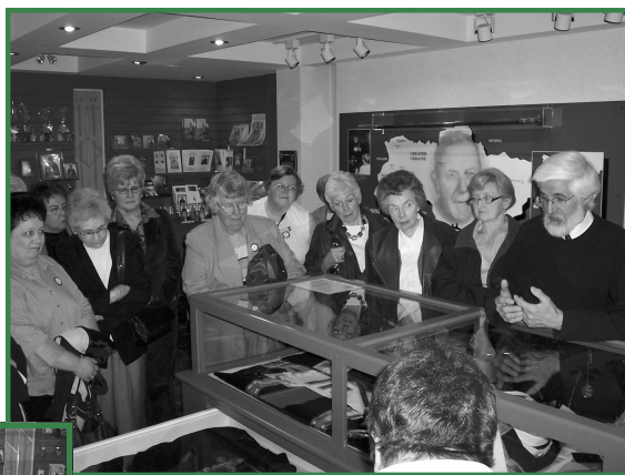
The CWLC of St. James-Assiniboia attend an Acatist Service and visitation of the Shrine