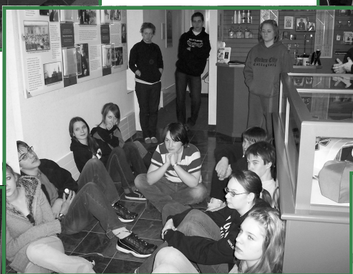
St. Joseph's Ukrainian Catholic Parish UCY visit the Shrine as part of their Lenten retreat.