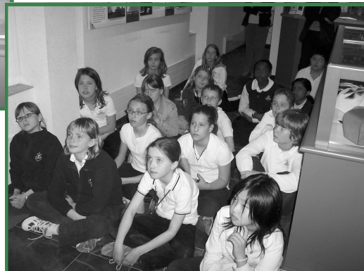
Christ the King School make their annual pilgrimage to the Bishop Velychkovsky Martyr's Shrine.