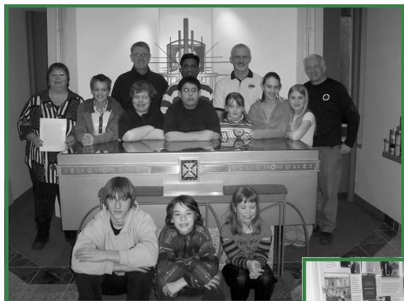
Christ the King Roman Catholic Parish spend their Saturday morning catechism class at the Martyr's Shrine