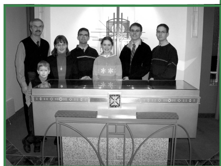
Sliva family from Yorkton make a pilgrimage to the Shrine.