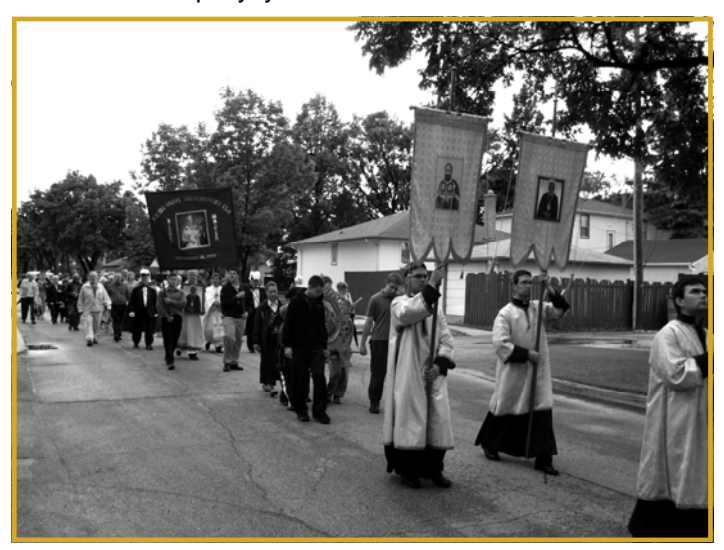
Evening Procession with the holy relics of Blessed Vasyl

As we are celebrating this happy occasion, the 7<sup>th</sup> anniversary of beatification of Blessed Bishop Nicholas Charnetsky together with 27 Companions among whom were Blessed Bishop Nykyta Budka – our first Ukrainian