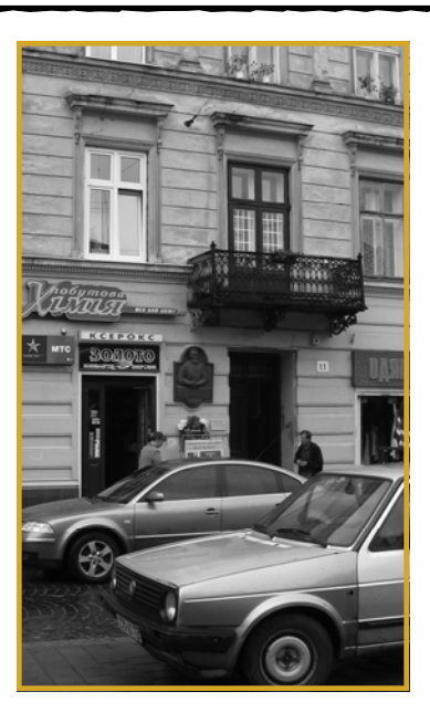
The entrance to Blessed Vasyl's apartment in Lviv near the Halychskiy bazaar.