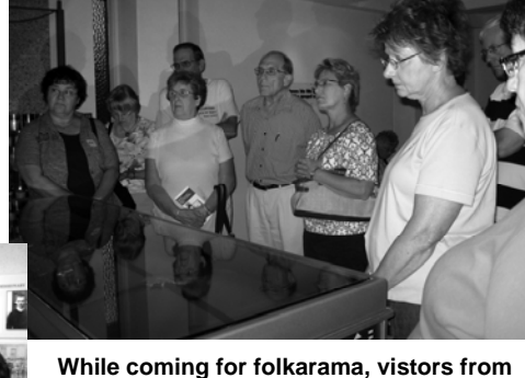
Minnesota visit the museum and shrine.