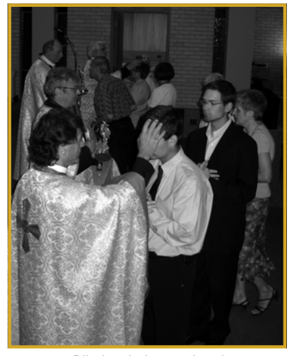
Pilgrims being anointed after the evening procession.

Blessed Bishop Vasyl you are: The Lily and Star of the Ukrainians. Also you are the great example of faith for us Ukrainian Canadians and for all people of the whole world to follow and live all the days of our life.