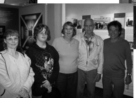
Visitors from Texas come to the museum and shrine