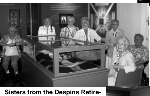
ment Home in St. Boniface visit the Shrine.