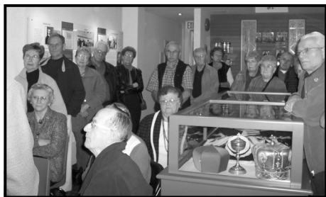
Pilgrims from Sts. Peter & Paul's in Saskatoon