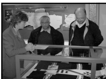
Redemptorist General Consultors from Rome