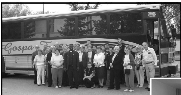
Gospa Bus Tour from Saskatchewan