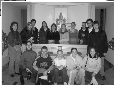
Youth Group from Notre Dame Parish in Lorette, MB