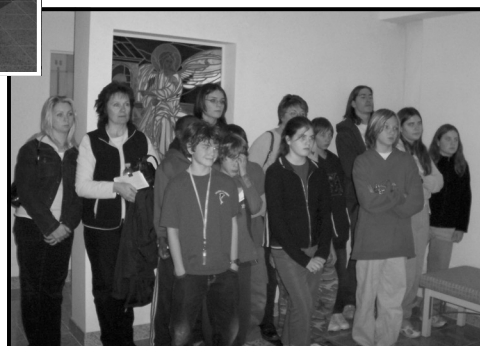
Catechism classes from Selkirk, MB