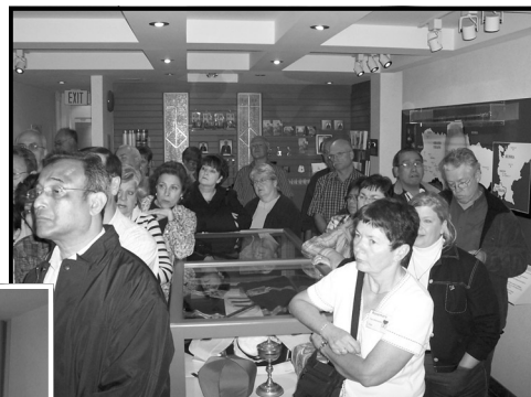
World Wide Marriage Encounter Council from around the world