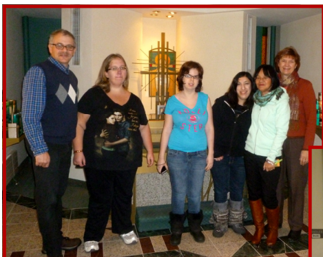
Life Skills Group from Maples Collegiate, Winnipeg