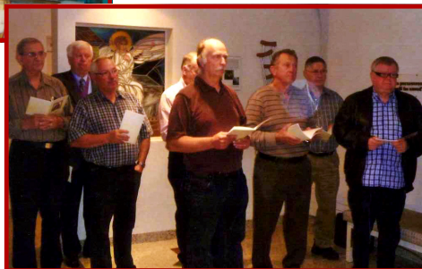
Fr. Shyshkowych Council Knight of Columbus, # 8925, Winnipeg