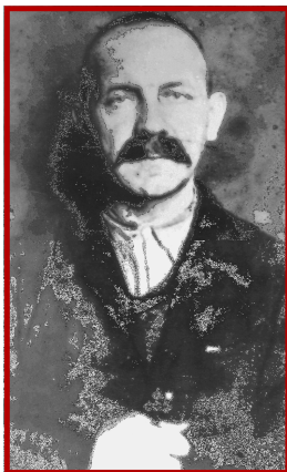
Blessed Vasyl in prison on death row, soon to be proclaimed Patron of Prison Chaplains

In August 2013, the Synod of the Ukrainian Greek Catholic Church announced the decision to name Blessed Vasyl Velychkovsky as the Patron of Prison Chaplains in Ukraine . They limited his patronage