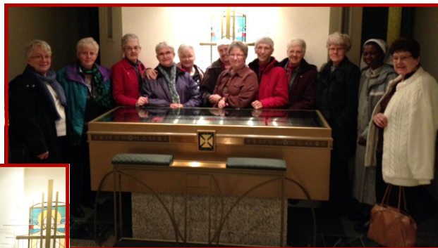
Assembly of Major Superiors of Religious in Manitoba