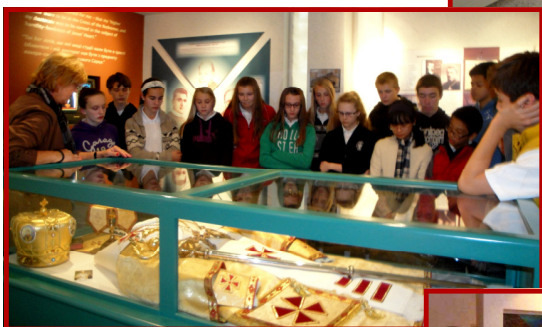
Grade 8 Class from Immaculate Heart of Mary School in Winnipeg