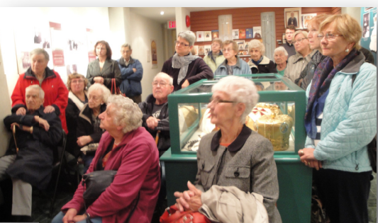
Blessed Virgin Mary Ukrainian Catholic Parish, Winnipeg, MB