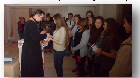
Students from the Ukrainian Catholic University in Lviv

to several youth groups: Quo Vadis from the Immaculate Conception Parish; Ixtus - from the Blessed Nicholas Charnetsky Church: a youth group from St. Josaphat's Redemptorist Parish: Don Bosco youth - organized by