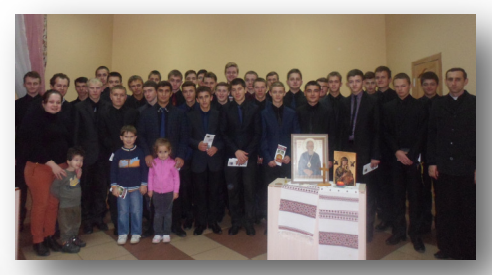
Seminarians from Rudno

Most of their work, however, has been in Lviv. Their presentations have been