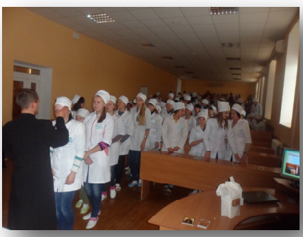
Medical College students in Chortkiv

stitute (Teacher's College). They visited St. Josaphat's College, which is a boy's school in Buchach and where