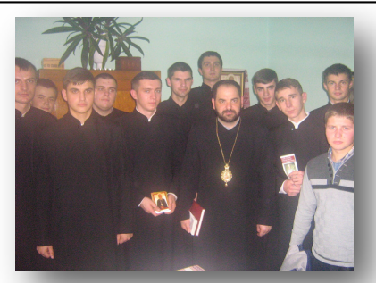
Seminarians from Drohobych

It is truly amazing how much has been done in such a short time. These presentations are not just an expose of