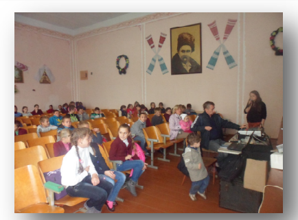
Grade school students in Dubivtsi

to several youth groups: Quo Vadis from the Immaculate Conception Parish; Ixtus - from the Blessed Nicholas Charnetsky Church: a youth group from St. Josaphat's Redemptorist Parish: Don Bosco youth - organized by