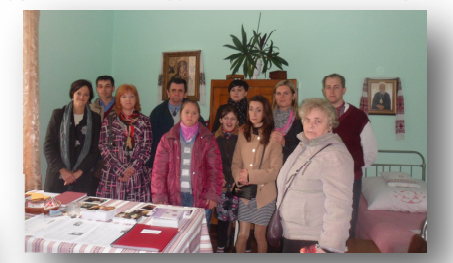
Faith and Light Ostriv community from Lviv

the Salesian Fathers; and Oktoix- a group of young adults organized by the Redemptorists. They have also visited some church groups: the Apostleship of Prayer from Sts. Volodymyr and Olga Parish; and the Archconfraternity of Our Mother of Perpetual Help from Immaculate Conception Parish. They have also met with two groups from the Faith and Light community (L'Arche type of ministry) Ostriv and Stritenya