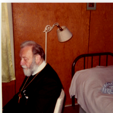
Blessed Vasyl preparing for confessions during a priest's retreat

Pope Francis encourages us to make a pilgrimage this year to those churches designated with "Holy Doors". By coming to St. Joseph's not only do you have the opportunity to go through the "holy doors" and receive the blessings and the grace which the Church bestows upon you, but you also can make a pilgrimage to Blessed Vasyl and plea before him to intercede for all your needs.