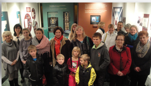
Pilgrims from Ukraine who now reside in Winnipeg