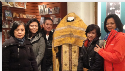
Pilgrims from the Philippines