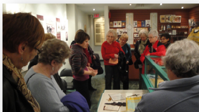
CWL members from St. Alphonsus Church, Winnipeg