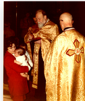
Blessed Vasyl blessing a mother and child after a baptism

vealed his great compassion and mercy. His readiness to accept and have mercy on the sinner inspires us to be more understanding and merciful to those who hurt us and have been unfaithful to us.