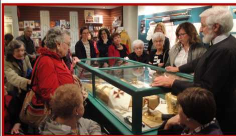
Members of Holy Family Ukr. Cath. Parish, Winnipeg

His Life with all. While in prison, he was heard praying for the prison guards, for those who tortured and abused him. When the Ukrainian Catholic priests were being arrested under the Soviet government, they were usually given the choice, to deny their Catholic faith and join the Russian Orthodox Church or go to prison. Some 1700 priests went to prison. Others, often reluctantly or out of fear, signed the papers and became Russian Orthodox priests. At that time Russian Orthodox priest were asked to spy for the Soviet authorities. After Blessed Vasyl returned from imprisonment in 1955 and especially after he was secretly consecrated a bishop in 1963, some of these priests were coming to him to be accepted again into the Catholic