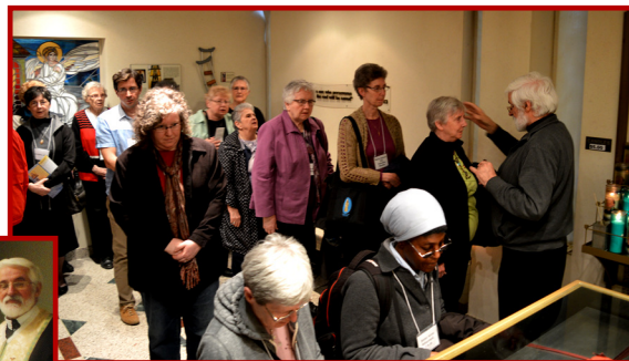
National Conference for Religious in Canada