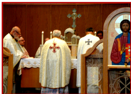
Ukrainian Catholic Bishops of North America celebrate the Divine Liturgy at the Shrine

On November 20 th , the Jubilee Year of Mercy came to an end. The Holy Doors, which were open to all pilgrims coming to the designated churches, were closed. This extraordinary year of grace ended. However, God's mercy endures forever, just as the psalmist wrote. It has been an extraordinary year at the Shrine. Bishop Velychkovsky Martyr's Shrine at St. Joseph's Ukrainian Catholic Church was designated as one of the six churches in Winnipeg to have a Holy Door. Those who came to the Shrine were given guidance