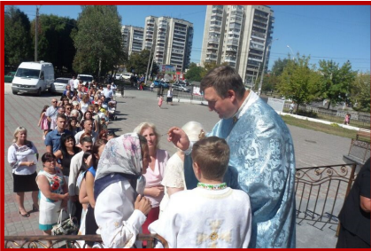
The church of Vozneseniya in Lviv was full of people coming to venerate the holy relics of Bl. Vasyl. Veneration continued outside.