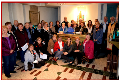
Parishioners from St. Anne's Ukr. Cath. Church, Winnipeg

Many also took the opportunity to make a full pilgrimage to the Shrine, that is, to participate in a spiritual tour of our museum and to spend some time at prayer before Blessed Vasyli's holy relics.