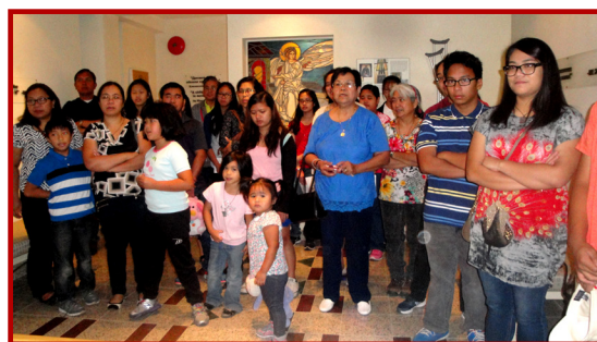
Member of the Legion of Mary and their families

Church. He welcomed them with open arms, without any sanctions or penances, just as the Heavenly Father welcomes sinners. On death row, he opened the door for many of the hardened criminals, to a sincere conversion of heart, and the receiving of the Sacraments. Before his first arrest, Blessed Vasyl saved