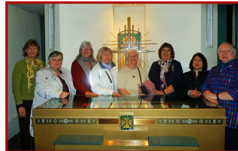
Women from several Roman Catholic parishes organized by St. John Cantius parish, Winnipeg

Church. He welcomed them with open arms, without any sanctions or penances, just as the Heavenly Father welcomes sinners. On death row, he opened the door for many of the hardened criminals, to a sincere conversion of heart, and the receiving of the Sacraments. Before his first arrest, Blessed Vasyl saved