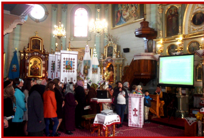
Tania making a presentation in the village church in Perehinsk