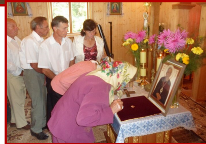
Veneration of relics in Yavoriv