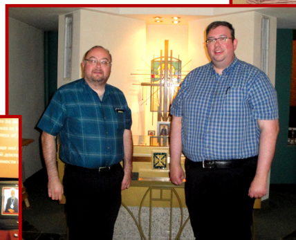
Pilgrims from South Dakota and Illinois