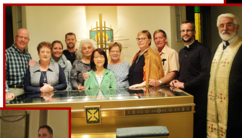
Prison Ministers from Grand Forks, ND