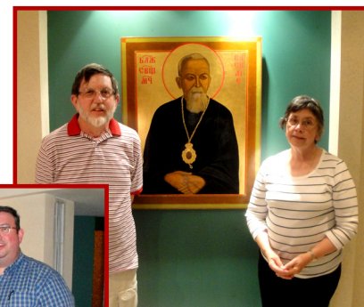
Pilgrims from Sydney Australia