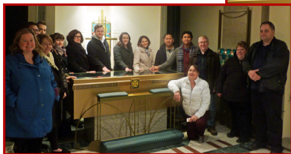
Roman Catholic and Ukraini- an Catholic Youth Leaders from across Canada