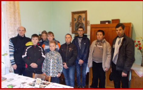
Altar servers from Lviv visiting Bl. Vasyl's apartment