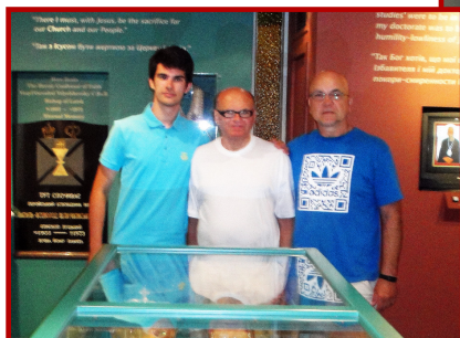
Pilgrims from Slovakia