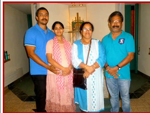
Family from India whose parents recently arrived in Canada

ca during their annual meeting in Winnipeg visited the Shrine and Holy Door. The clergy from the Archeparchy of Winnipeg held their "soborchyk" (meeting) at St. Joseph's and included the Holy Door as part of their noon day prayer. Some 100 members of the Legion of Mary choose