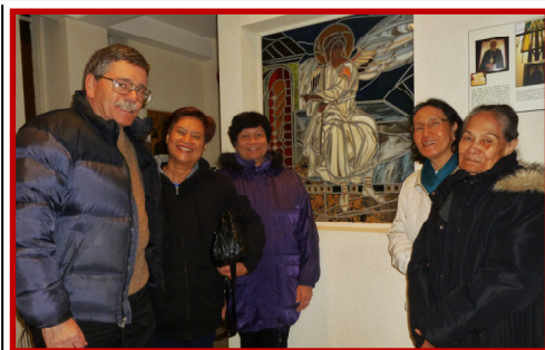
Parishioners from St. Anthony Roman Catholic Parish, Winnipeg

Various groups made a special visit in order to go through the Holy Door. The Ukrainian Catholic Bishops of North Ameri-