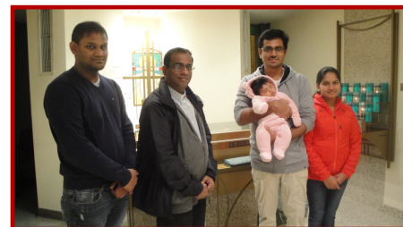
Syro-Malabar family with their parish priest

and hid numerous Jewish children from the massacre of the Nazis. Blessed Vasyl revealed to us the Father's mercy by his actions and relations with people in need. He continues to be an arm of the Father's mercy as he now intercedes for all those who come to him with their needs and with faith.