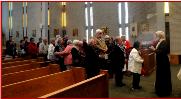
Parishioners from 4 parishes near Thief River Falls, Minnesota USA

the Shrine to spend the morning at prayer. Prison ministers from Grand Forks, North Dakota came to pray before the "Patron of Prison Ministry" – Blessed Vasyl, and took the opportunity to experience the Holy Door. Four parishes with their pastors from Thief River Falls, Minnesota made a special trip to Winnipeg with the sole purpose of vis-