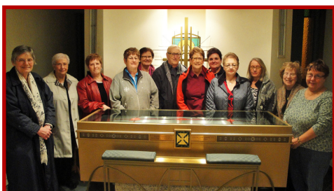
St. Nicholas Ukr. Cath. Parish, Winnipeg

the Shrine to spend the morning at prayer. Prison ministers from Grand Forks, North Dakota came to pray before the "Patron of Prison Ministry" – Blessed Vasyl, and took the opportunity to experience the Holy Door. Four parishes with their pastors from Thief River Falls, Minnesota made a special trip to Winnipeg with the sole purpose of vis-