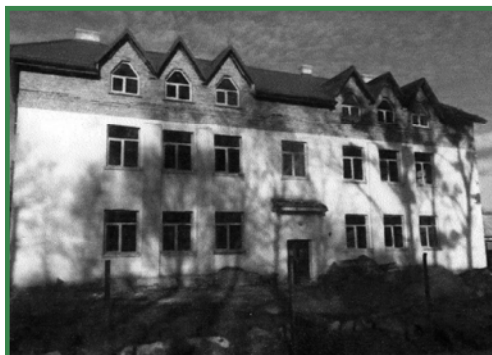
Safe-house being built by NASHI in Stoyaniv Ukraine to combat human trafficking.