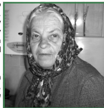
An orphan cared for by Blessed Vasyl

While he was superior in the monastery in Ternopil, 1942-45, during the War, he sheltered and saved some twenty Jewish children from the Nazis. He was