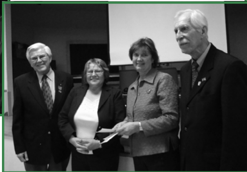
Holy Eucharist Men's, Women's and Knight's Organizations present donations to the Shrine