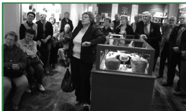
Holy Eucharist Ukrainian Catholic Parish making their 8th annual Pilgrimage to the Shrine