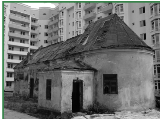
Church in Zboisk where Blessed Vasyl was ordained

Blessed Vasyl described his ordination in his autobiography: "Another joyful day - October 9, 1925, the feast of the Translation of St. John the Theologian: at twenty-two years of age I received the great Mystery of Priesthood from the hands of Bishop Joseph Bocian, Bishop of Lutsk, a great pravednyk, who had been consecrated bishop by Metropolitan Andrew during the latter's exile, in Kyiv. Our Metropolitan Andrew was, at that time, resting in Pidliuty, and so the gracious Bishop Joseph came to us in Zboiska; and here, in the little monastery church, he carried out this great event - he conferred on me the Priesthood. Now, there is nothing more that my heart could desire, because I have everything in Jesus, whom I hold in my hands, offer in sacrifice, give to the people. Christ is my strength, my God and my Lord! My heart - though it is so small, so miserable - is full of joy!"