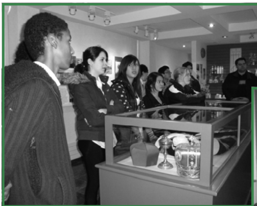
Students from Our Lady of Victory Catholic School come to learn about Blessed Vasyl