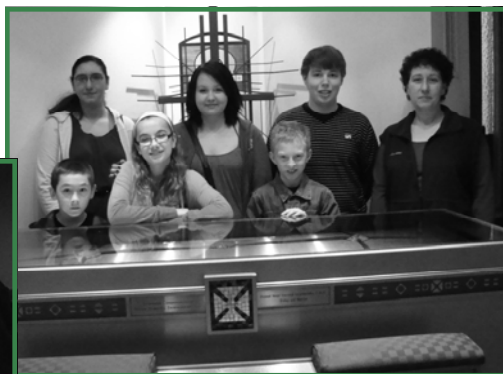
St. Basil's Ukrainian Catholic catechism class visit the Shrine