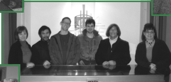
"Come and See" participants from across Canada