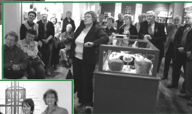
Holy Eucharist Parish make their 8th Annual Pilgrimage