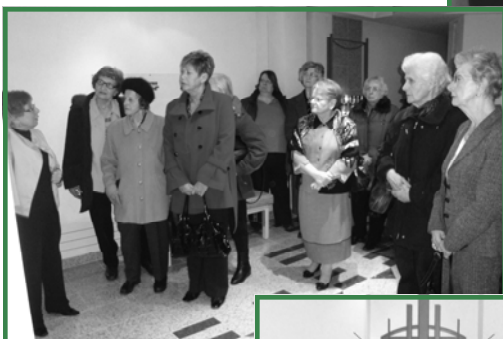
U.C.W.L.C Regional of Winnipeg include a visit as part of their monthly meeting