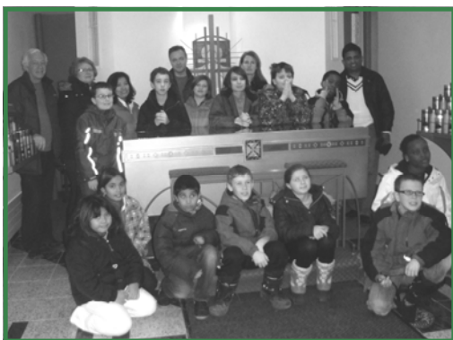
Catechism students from Christ the King (RC) make their annual pilgrimage