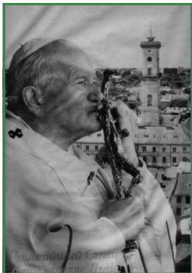
Blessed Pope John Paul II visits Ukraine June 2001

The Church rejoiced on May 1 st , 2011, when our beloved Pope John Paul II was proclaimed a Blessed. St. Peter's Square was packed with over a million faithful who came to witness and celebrate this glorious beatification. Ten years ago a similar event took place in Ukraine when Blessed Pope John Paul II beatified a number of Ukrainian martyrs and blessed. I personally had the privilege to be present at this beatification.