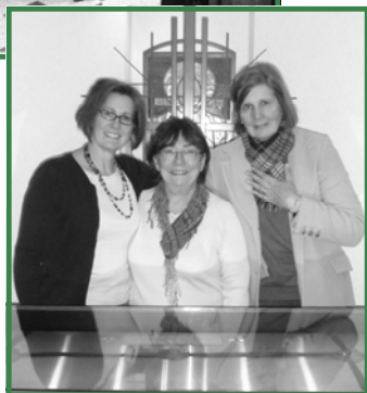
Pilgrims from Calgary, Alberta spend a day in prayer.