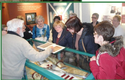
Ladies from St. Timothy RC Parish, Wpg