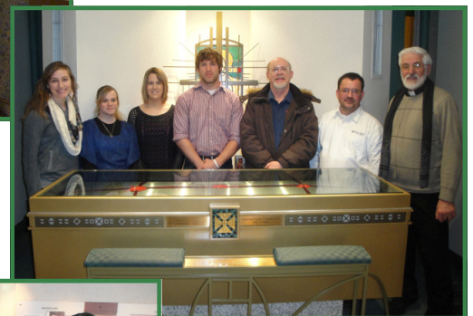
Mount Marty College English Club from Yankton, South Dakota, USA