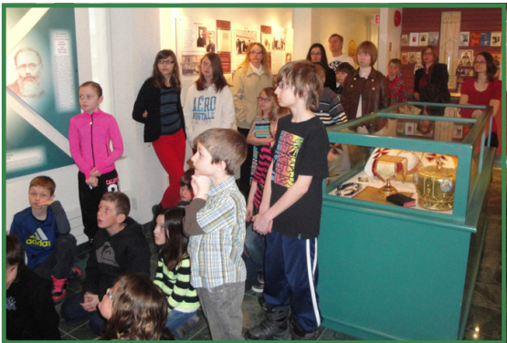
The catechism children from St. Joseph's Ukrainian Catholic Parish, Wpg tour the museum and shrine