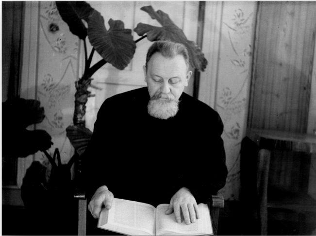
Blessed Vasyl in Ukraine giving a retreat during the same time period as he wrote his book on Our Mother of Perpetual Help

devotional life of eastern Christians, the Ukrainian Catholics embraced this icon as their own. The icon can be found adorning many of the Ukrainian Catholic Churches both in North America and in Ukraine.