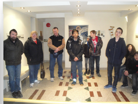
Christ the Saviour Parish Confirmation Class from Steinbach, MB