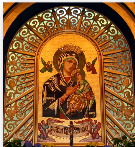
The large icon of Our Mother of Perpetual Help behind the altar in the Redemptorist Church of St. Mary's in Yorkton SK

When the Redemptorists began serving the Ukrainian Catholic Church in the beginning of the 1900's, they brought this icon with themselves. As icons are very common in the