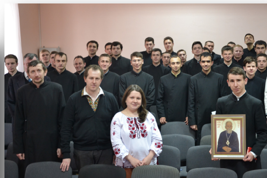
Seminarians from Drohobych