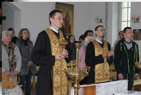
Bringing the relics and anointing to Minsk, Belorussia