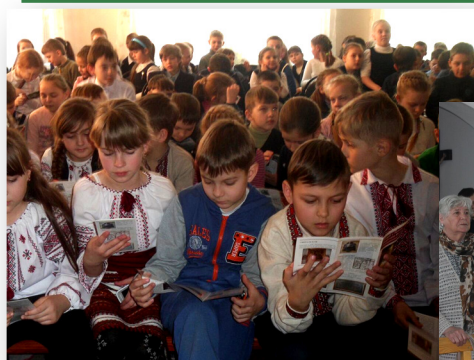
Middle school "Pervotsvit" in Lviv