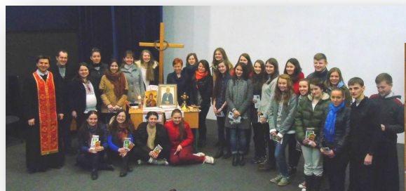
Basilian Youth Group from Bruhovych near Lviv