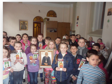
First Communion Class from the Blessed Zenon Kowalyk school in Lviv