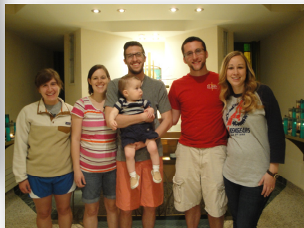
FOCUS Catholic Campus Missionaries from the University of North Dakota