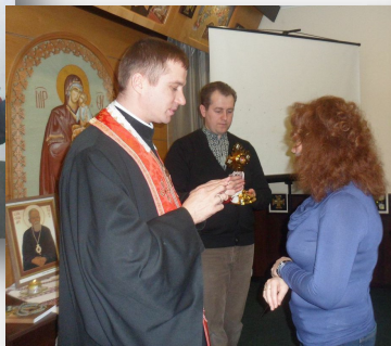
Svichado Staff being anointing in Lviv