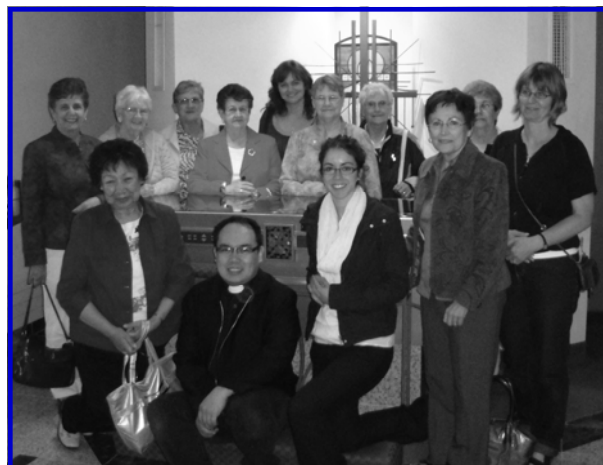
Parishioners from St. Timothy's Roman Catholic Parish in Winnipeg