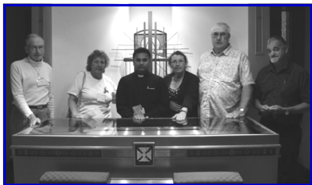
Participants from the Marian Conference in Winnipeg