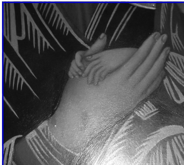
The icon of Our Mother of Perpetual Help in the Shrine Chapel weeping perfumed oil.

On January 5, 2011 (the eve of the Theophany-Baptism of our Lord) one of our Shrine staff, after praying before the holy relics of Blessed Vasyl, came to pray before the icon of our Mother of Perpetual Help which is in the Shrine Chapel. As she was praying, she opened her eyes and saw a drop-let of perfumed oil flowing from the hands of our