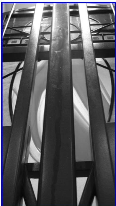
The Cross of Resurrection in the Shrine chapel weeping oil.