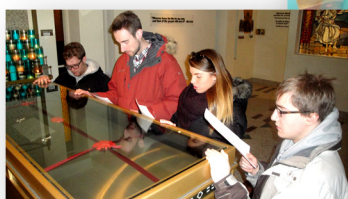
Catholic ARISE Group from Winnipeg