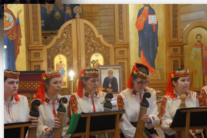
A Bandura performance in the church of Bl. Charnetsky in Lviv during a presentation on Bl. Vasyl