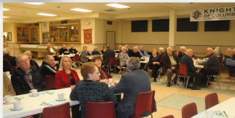
Canon Luhovy Assembly #374 from Winnipeg view a presentation on the proclamation of Bl. Vasyl as Patron of Prison Ministry

You may now DONATE ONLINE . Our online donation portal is now available on our website for your convenience. If you wish to donate on our secure site, complete the form on our "Support Us" page.