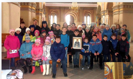
Children from Kokhavyna near Stryi after a presentation about Blessed Vasyl