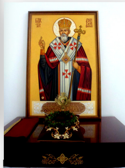
Patron of Prison Ministry Icon with relics which is in the Sobor of the Resurrection in Kyiv