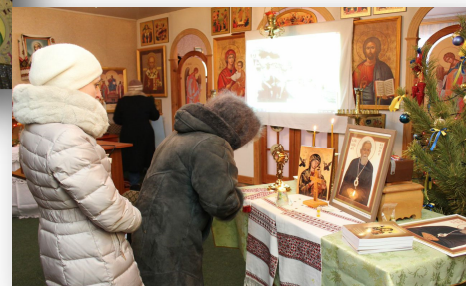
Parishioners from the village of Rosdilne near Odessa venerating the relics and the icon