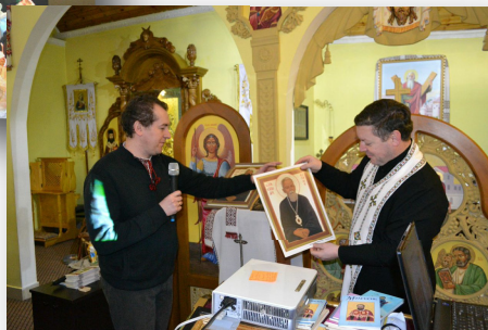
Pastor of St. Andrew's Cathedral in Odessa receiving an icon of Blessed Vasyl