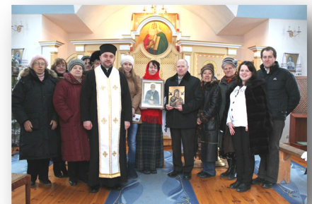
Parish of St. Elias in the village of Ilichsk near Odessa