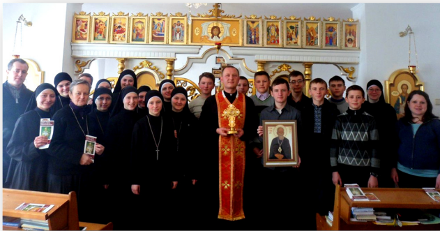
The Incarnate Word Community in the village of Krykhyvtsi near Ivano-Frankivsk