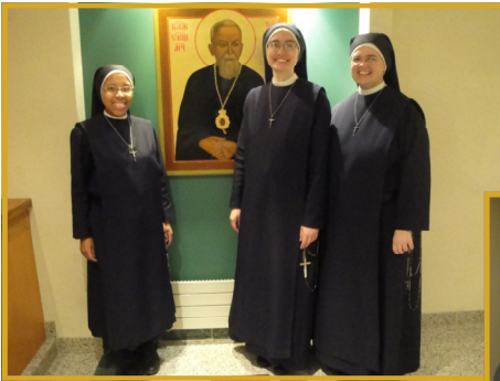
Sisters of Our Lady Immaculate from Stoney Creek, ON