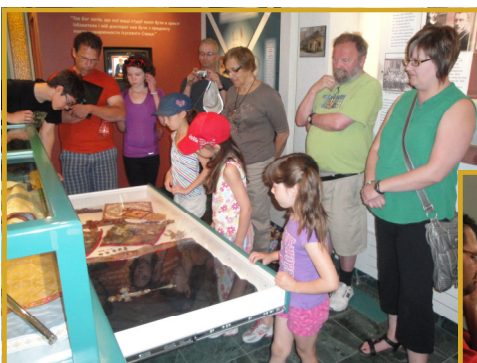
Welcome Home 25th Anniversary Reunion of former Volunteers