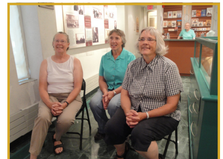
Visitors from the Marian Conference held in Winnipeg