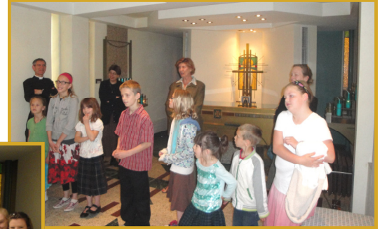
Our Lady of the Rosary, Roman Catholic Parish, Winnipeg, MB