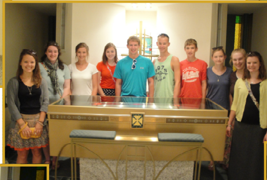
Young adults from Wisconsin and Texas, USA