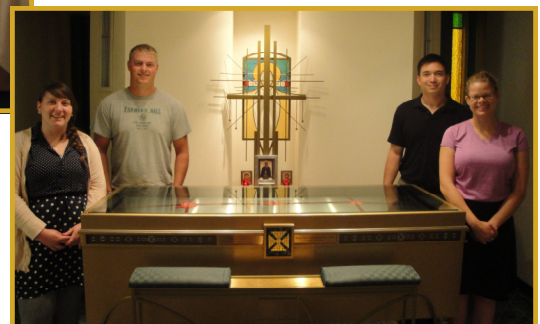
FOCUS, The Fellowship of Catholic University Stu- dents from Unniversity of North Dakota in Fargo, ND