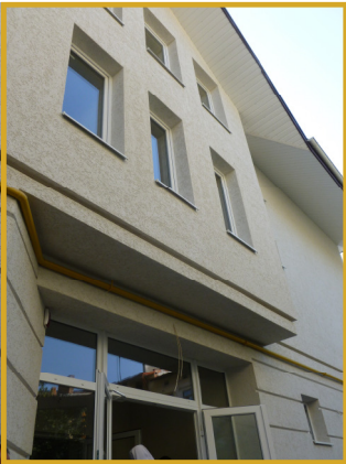
Home of Hope in Lviv