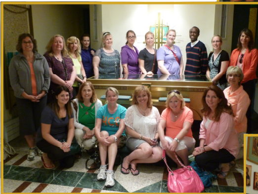
St. Charles Catholic School Staff, Winnipeg, MB