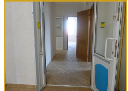
Interior of the Home of Hope in Lviv

This past summer under the patronage of the Sister Servants of Mary Immaculate, a new ministry was started in Lviv. With the help of donations from Canada, especially the Eparchy of Edmonton, and others, they have been able to build a safe house, called the Home of Hope. This house will provide shelter to some 23 young girls, coming from orphanages. The home will provide shelter, education and life opportunities for girls 16+. Two or three sisters will reside in the home, ministering to these girls. This project was started because of the growing danger of human trafficking of girls leaving the orphanages. Human trafficking in Ukraine is at a crisis level. There are hundreds of thousands of children who are homeless. They become prime candidates for human exploitation. They are either bought from the orphanages or simply taken. Often being offered a "good life" in some foreign country, they find themselves enslaved in human trafficking. They are bought and sold like objects, devoid of human dignity and forced into prostitution. The Home of Hope is an attempt to save at least some of these girls.