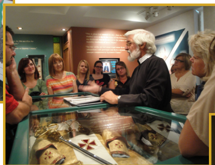
IHMS Catholic School Staff, Winnipeg, MB