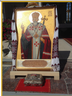
Icon of Blessed Vasyl specially written for this occasion. Before it are his holy relics that were brought from Ternopil.

came with us from Canada), we prepared 2,000 vials of Blessed Vasyl holy oil. We printed 120,000 holy cards and icons for distribution. Material, including a number of books and icons, etc. were transported by a large van from Lviv to Zarvanytsia. We were able to set up two small kiosks to make available these religious items for the public.