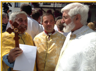
1st Class Relics, embedded in a wooden cross, were presented to Eparchial prison chaplains