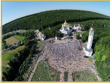
A bird's eye view of the Marian Shrine