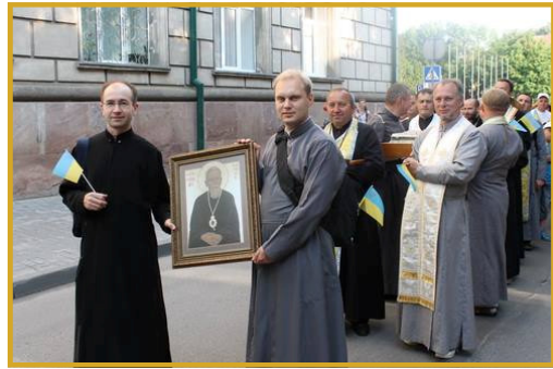
Pilgrim procession from Ternopil to Zarvanytsia (65 km walk)