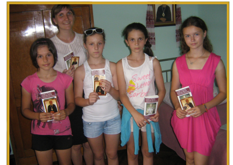
Children of Mary – from Parish of the Mother of God