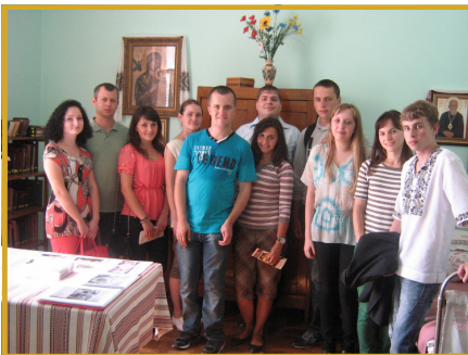
Youth Group called "I am Christian"