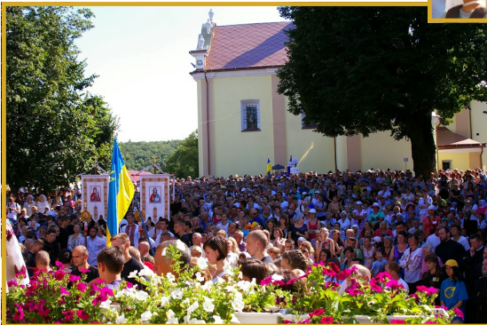
Pilgrims present at the "Velychkovsky Program" by the parish village church