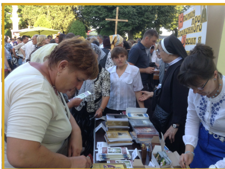
Purchasing religious items at the Velychkovsky kiosk