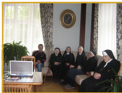
Presentation to the Basilian Sisters in Lviv