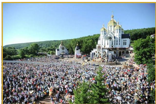
The Marian Shrine of our Lady of Zarvanytsia, Ukraine