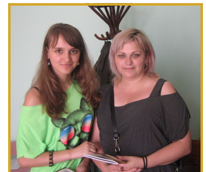
Mother & daughter from Lviv