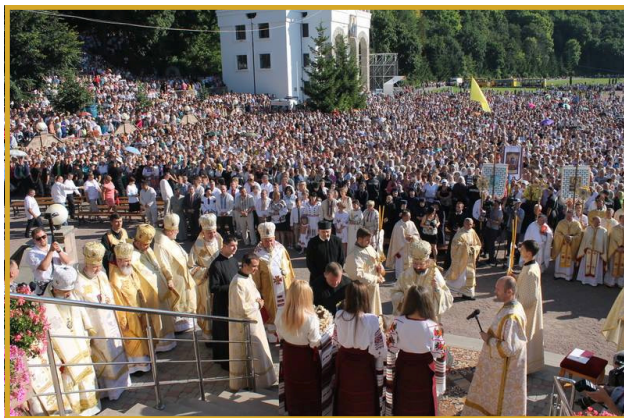
Youth greeting the Patriarch at the beginning of the Sunday Pontifical Divine Liturgy