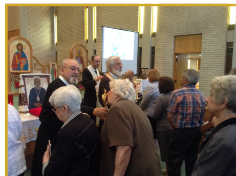
Faithful venerate the Relics and are anointed with Blessed Vasyl Holy Oil

The feast day was attended by pilgrims from across Canada and the United States. Because of inclement weather the evening procession was changed to a candlelight living rosary in the church. The faithful received many graces and blessing that day.