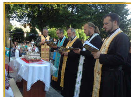
Prison Chaplains leading the Acatnist Service

Redemptorist seminarians and youth. It was very inspiring, creative and moving. Following the play, the prison chaplains led the Acatnist service in honour of Blessed Vasyl. The responses were sung by Redemptorist priests and sisters. The program was very well received by over 20,000 people. After this presentation, our humble sales table became very busy, selling books, trip-ticks and holy oil.