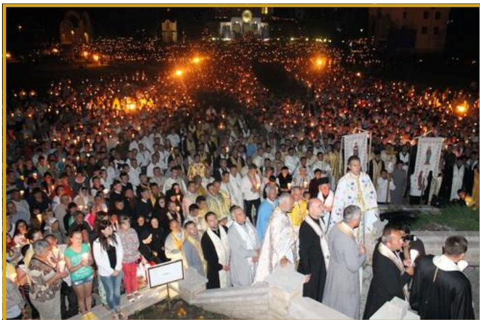
Celebrating Moleben by candlelight at midnight before a crowd of tens of thousands.

celebrated a Moleben to the Mother of God and then proceeded after midnight to celebrate a Panahyda Service for all those who had given their lives recently for Ukraine, whether on the Euro-Maidan or in the ongoing war. At 1:00 am on two large jumbotrons in the main square of the Shrine grounds, a film on the life of Blessed Vasyl was shown. It was watched by tens of thousands. This was the first time that many ever heard of Blessed Vasyl. The film was shown three times throughout the night and just before the Sunday morning Divine Liturgy. People remained in the square all night, praying, sleeping, or in fellowship until dawn until the morning services.