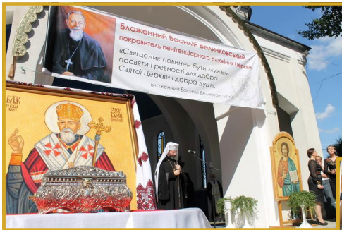
Patriarch Sviatoslav addressing pilgrims from the outdoor Chapel