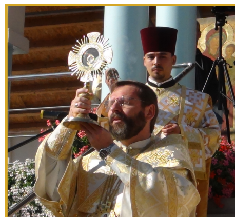
Patriarch Sviatoslav blessing the pilgrims with the holy relics of Blessed Vasyl