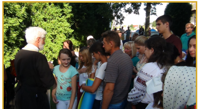
Outdoor anointing of pilgrims with Blessed Vasyl Holy Oil