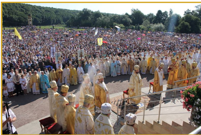
Divine Liturgy being celebrated by the Patriarch, Metropolitans and Bishops before 200,000 faithful on Sunday, July 20th

The whole weekend was truly historical and a highlight of our Shrine ministry. Next to the beatification and the enshrinement, this event marked a chapter in the life of our Blessed. Being proclaimed a Patron, Blessed Vasyl now receives from the Church a special ministry to those who are imprisoned, without