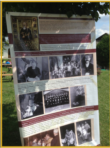
Banner depicting the life of Blessed Vasyi