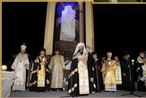
Patriarch and bishops celebrating the Moleben Service before the statue of the Mother of God