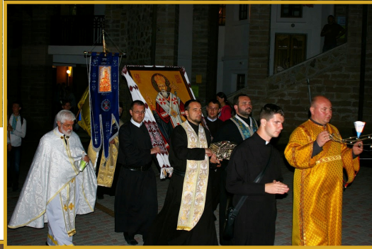
Redemptorists carry the relics and icon in the candlelight procession