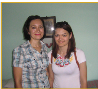
Mother & daughter from Chernivtsi