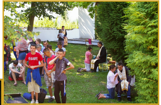
Outdoor confessions throughout the Shrine area