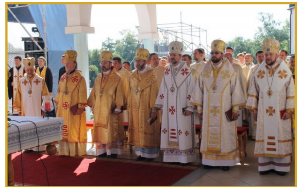
Bishops of Ukraine at the Pontifical Divine Liturgy