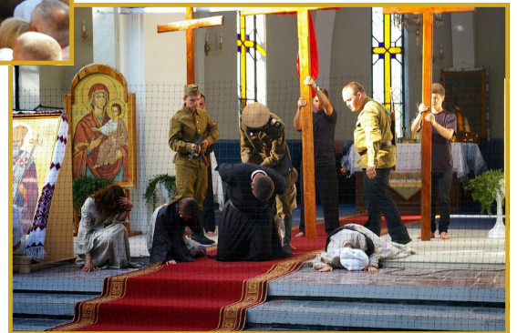
Play presentation on the prison life of Blessed Vasyl