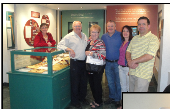
Visitors from Calgary, AB