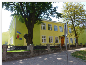
Blessed Vasyl's high school in Horodenka