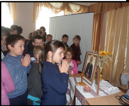
Students and staff of a grade school in Tomachyk, Ivano-Frankivsk