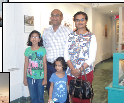
Pallickaparambil family from East India