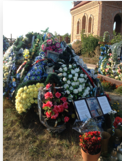
Recent grave of a fallen soldier

began) and families whose 'heroes' have returned from the front line maimed, missing an arm or a leg, or severely traumatized by what they saw and experienced. There are so many of them and until now little is being done for them. We heard of various groups, such as priests, nuns, and laity, who are beginning to organize themselves to provide some relief to these victims. We ourselves met some of these distraught and destitute families. They desperately need our financial help to be able to provide the necessary assistance for these families.