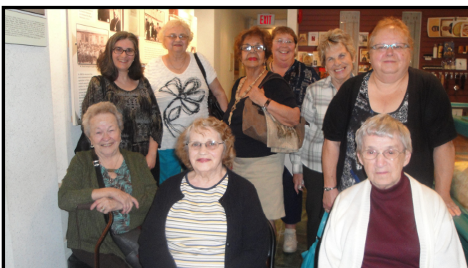
Holy Cross CWL Ladies, Winnipeg, MB