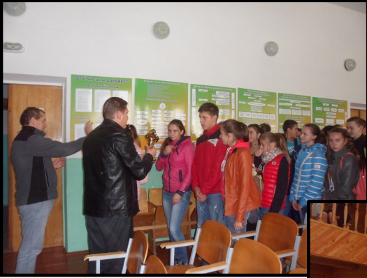
Grade 11 students in Krasna, Ivano-Frankivsk