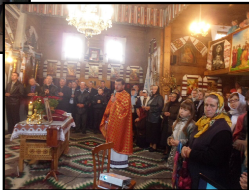
Parishioners at a presentation from Yarma, Carpathian Mts and their parish church