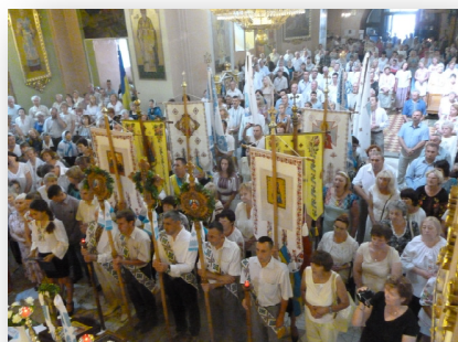
Parishioners in Chernytsiv attending the feastday of the church during the mission

Since Blessed Vasyl Velychkovsky was proclaimed the Patron of Prison Ministry for the Ukrainian Greek Catholic Church in Zarvanytsia last summer, 2014, knowledge of who he was and who he is, is quickly growing throughout Ukraine. Our yearly trip to Ukraine bore witness to this fact. We spent