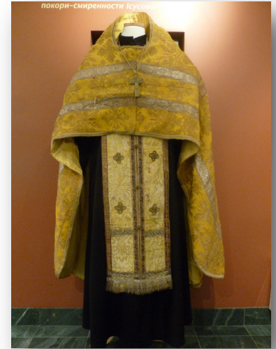
Vestments worn by Blessed Vasyl during his time in Volyn in the 1930's