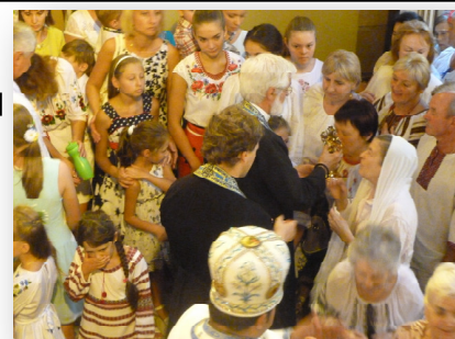
Parishioners venerating the Relics and being anointed