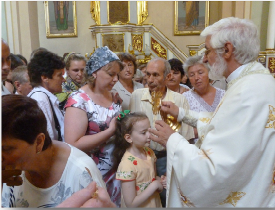
Parishioners in Horodenko venerating the Relics, being anointed and receiving a 3rd Class Relic.