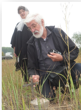
A small cross was blessed with Blessed Vasyl holy oil at the site of the new church