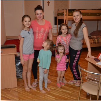
Two families from Luhansk and Donetsk taking refuge in Lviv with the Sister Servants of Mary Immaculate

This summer we spent three weeks in Western Ukraine and noticed a radical change. It was evident in the mood of the people, in the sight of recent graves of young men killed, of the loomed uncertainty of the future, and of the numerous refugees from Eastern Ukraine. The armed struggle in the Donetsk and Luhansk region continues to this day. Every-