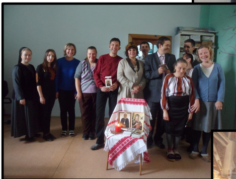
Members of a L'arche community in Lviv