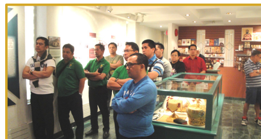
"Peter's Chord" a group of singing Filipino priests

On August 27, we were pleased to welcome over 100 members of the Legion of Mary who came to the Shrine for a day of renewal. Most of the members were from the Filipino community. We began with the Divine Liturgy to which the whole community responded enthusiastically. For many this was their first experience of the Byzantine Liturgy. After the Liturgy, the rosary was recited. Then a 15 minute video presentation on the life of Blessed Vasyl was shown. This