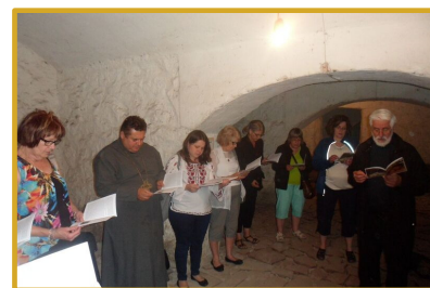
Praying the Way of the Cross in underground prison cells in Chortkiv