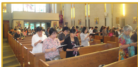
Legion of Mary group making a pilgrimage to the Shrine

was followed by a tour of the museum and shrine and a brief introduction to the spirituality of the Byzantine Church. The morning of prayer and renewal was very warmly received. For many of them this was their first visit to the Shrine. Since this experience, many of them have come for a return visit to pray at the Shrine and pray before the holy relics of Bl. Vasyl.