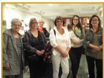
Ladies from Edmonton attending National UCConference