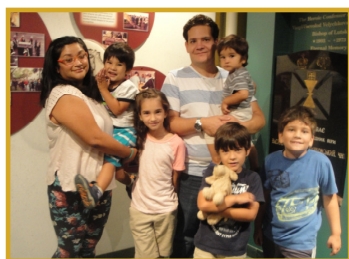
Murdock family from Calgary, AB