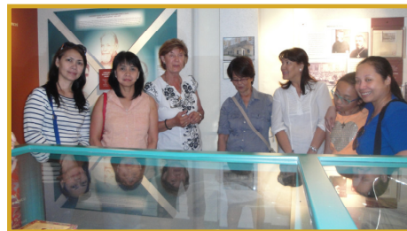
Visitors from the Philippines