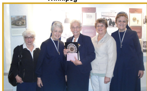
SSMI Sisters and delegates from the National UCConvention