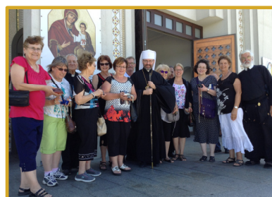
With Patriarch Sviatoslav at the Sobor of Resurrection in Kyiv