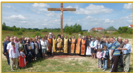
Parishioners, pilgrims and clergy present at this solemn blessing in Kovel