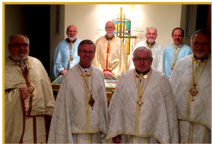
Ukrainian Catholic Bishops of North America