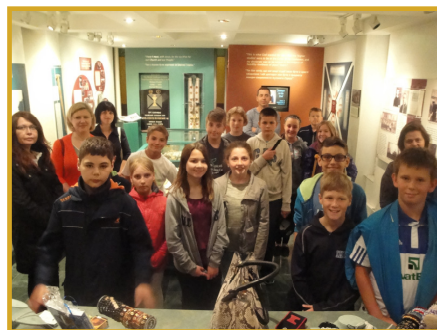
Students and teachers from Ukrainian School of Ss. Vladimir & Olga Cathedral, Winnipeg