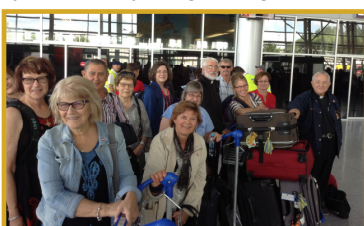
2016 Bishop Velychkovsky Pilgrimage group in Lviv airport

This past July we conducted our 4 th Bishop Velychkovsky Pilgrimage to Ukraine. As with the past