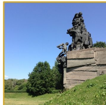
Babyn Yar in Kyiv where Jews were massacred

and executed there. While in Kyiv, we also visited the very moving Holodomor museum dedicated to the 7 million plus people killed by starvation during the Stalinist regime. We also visited Babyn Yar, where over 33,000 Jews were massacred by the Nazis on September 29-30, 1941. Both these sacred places made us more aware of the horrific things human beings can do to others and of our responsibility to give each person their due dignity.