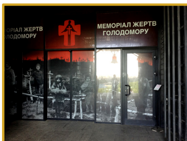
Holodomor museum in Kyiv

of a prison, the Lukianskaya Prison. It is hidden from the main streets in central Kyiv. In