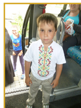
An orphan from the orphanage in Potelych