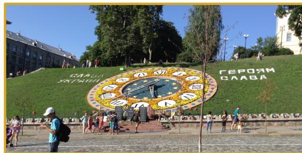
Street honoring the "Heavenly Hundred" who lost their lives in the Euro Maidan in February 2014

Blessed Vasyl's journey of life inspires us to follow Christ more whole-heartedly and to be willing to pay the price in remaining faithful to the Gospel.