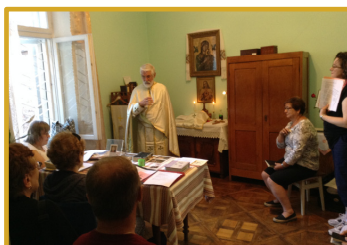
Celebrating the Divine Liturgy in Bl. Vasyl's apartment in Lviv

Our pilgrimage began with the celebration of the Divine Liturgy in Blessed Vasyl's apartment, where he lived in his later years during the time of the catacomb church (1955-1969). During these years, this apartment was the nerve center of the Ukrainian Catholic Church. Priests and sisters would come there for guidance in their pastoral ministry in those trying times. After Blessed Vasyl was secretly consecrated a bishop in 1963, one can say that this was his cathedral and his chancery. The apartment