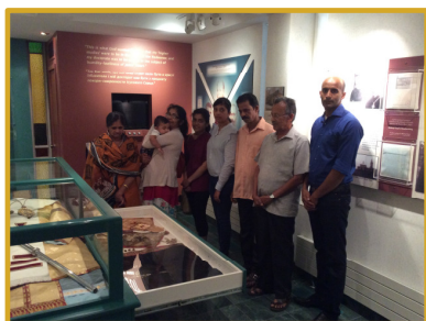
Pilgrims from Winnipeg