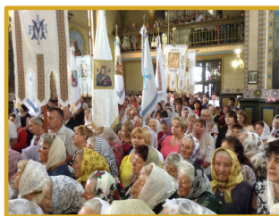
Parishioners at the praznyk