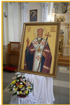
Bl. Vasyl as Patron for the Youth festival

From July 27-30, 2017, a youth rally was held in the beautiful ancient city of Kamianetz-Podilsky. Some 280 youth from the various Redemptorists parishes gathered for a bi-annual festival called "Being Called to the Kingdom". The patron chosen to guide the youth of this journey was Blessed Vasyl Velychkovsky. Blessed Vasyl himself had come to Kamianet-Podilsky as a missionary in 1941. He writes of this event in detail in his autobiography. The festival was filled with singing, fellowship, teachings, prayer, drama presentations etc.