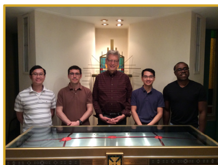
Redemptorist novices from Toronto