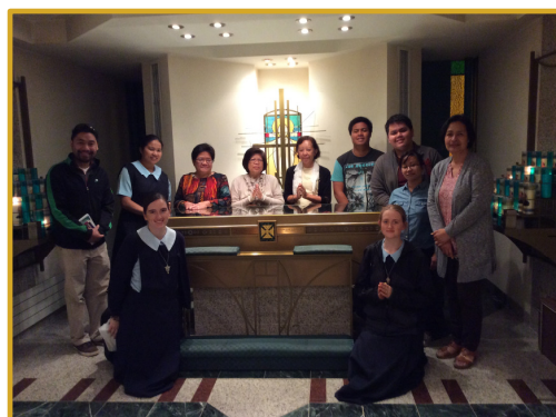
Sisters of the Alliance of the Hearts of Jesus and Mary on pilgrimage throughout Canada with the Fatima Statue