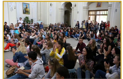
Youth from all of Ukraine gather in Kamianetz-Podilsky for the festival