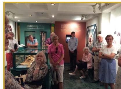
Members of the River East Menonite Church, Winnipeg