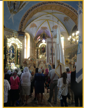
Inside Bl. Vasyl's childhood Parish Church

It was most fitting that Blessed Vasyl's Holy Relics were brought and given to this parish in Probizhnia on the great day of Her feastday, the Dormition - the church, where he received a "second" mother, who guided him throughout his life, who led him through his arrests and imprisonments to give his whole life to Jesus, Her Son.