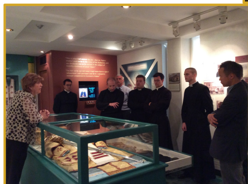
Seminarians from the Fraternal Society of St. Peter, Denton, Nebraska