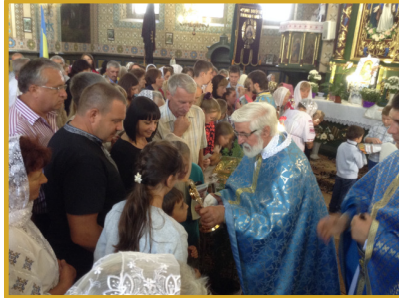
Veneration of the Holy Relics during the praznyk

From his autobiography we read: "Thus from seven years old I am publicly consecrated and belong to the dear Mother of God; and She received this dedication, and publicly acknowl-