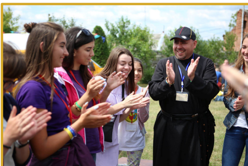
Youth at the weekend rally