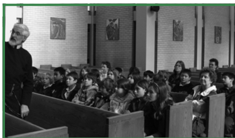
Grade 5 students from Christ the King Catholic School yearly visit the Shrine