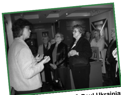
Ladies from Sts. Peter & Paul Ukrainian Catholic Parish in Winnipeg come to learn about Blessed Vasyl