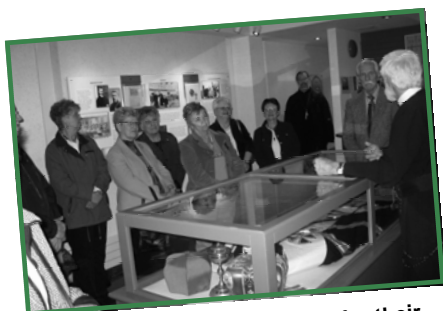
Holy Eucharist Parish comes for their annual pilgrimage