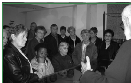
Associates of St. Marguerite d' Youville pray before the sarcophagus