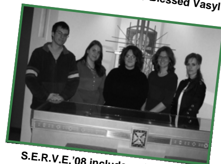
S.E.R.V.E. '08 include a visit to the Shrine as part of their program