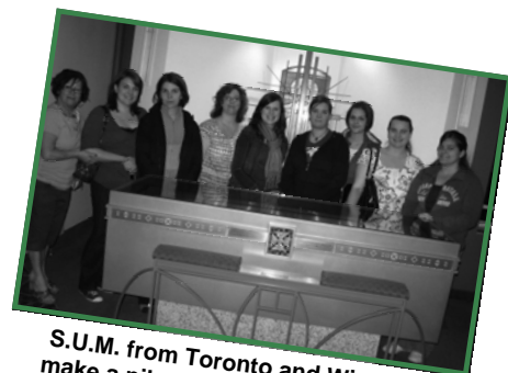
S.U.M. from Toronto and Winnipeg make a pilgrimage to Blessed Vasyl