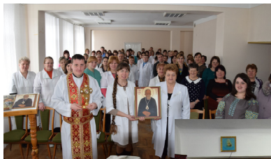
Presentation to the medical staff in a hospital in Chortkiv