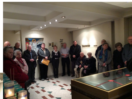
Canon Luhovy Assembly #374 , Wpg and their families make a pilgrimage to the Shrine