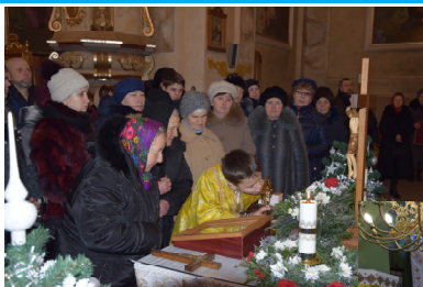
Venerating relics of Blessed Vasyl in Buchach