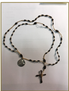
A rosary made from bread similar to the one Blessed Vasyl used

"The time approached for the review from the prison guard. They came around daily before the barracks were locked down for the night. Everyone scattered. After the review, Father and I went to our dark corner. On the bunk there was a mattress, a pillow stuffed with wood shavings, two sheets and a cover stuffed with padding. I knelt down, said a short prayer and went to bed. Father prayed for a long time on his rosary. In the morning, I saw that his rosary was made from bread. The bread they gave us was so moist (damp) that one could even form crosses from it.