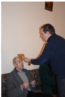
Prayers with seniors at Caritas in Chortkiv