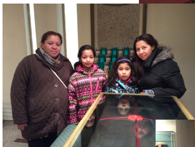
Pilgrims from El Salvador