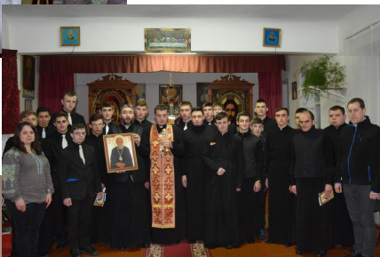
Presentation at the Academy for Cantors in Chortkiv