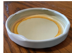
A jam cover similar to the one used by Blessed Vasyl while in the barrack in Vorkuta

"He also conducted short Divine Services, confessed and gave Holy Communion to us. This occurred often in our free time from work. One must say that although not many were present, but for those who wanted to be there, it was very fulfilling. The strict regime always had a watchful eye upon us. We and the priests would come to him individually, so that it would be less obvious. In this way, we met with Father personally.