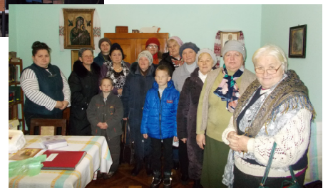
A Mother's Prayer Group at the Blessed Vasyl museum from the village of Borshchovytsi