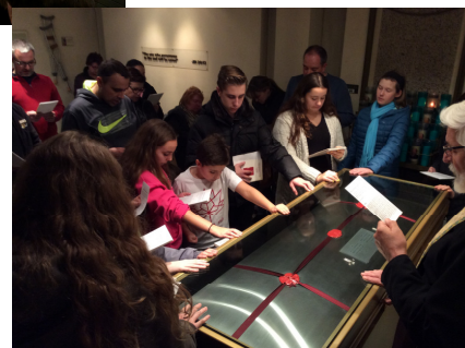
Confirmation Preparation Class and their families from St. Theresa's RC, Wpg