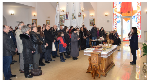
Presentation in Ivano Frankivsk at the Church of the Nativity of Mary, built on the place where Blessed Vasyl was once superior