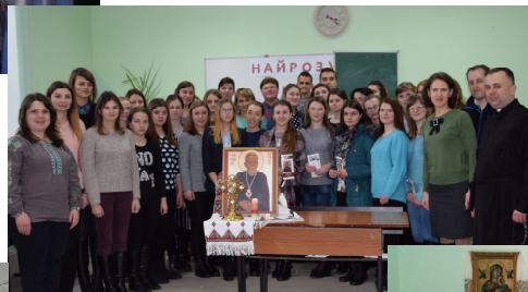
At the Barvynskiy College of Arts and Education, Chortkiv