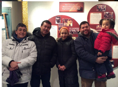
Gonzales family from Mexico