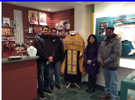
Pilgrims from Scarborough and Brampton, ON (org. from Kerala, India)