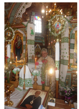
During a presentation in St. Michael's Church in Kozava