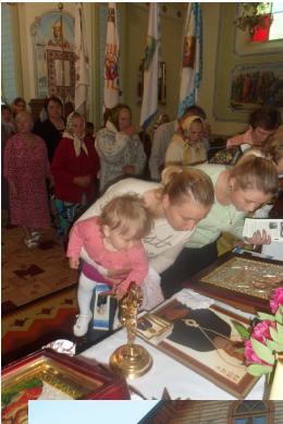
Venerating the icons and relics at Ss. Peter & Paul Church, Velyki Polyhiv