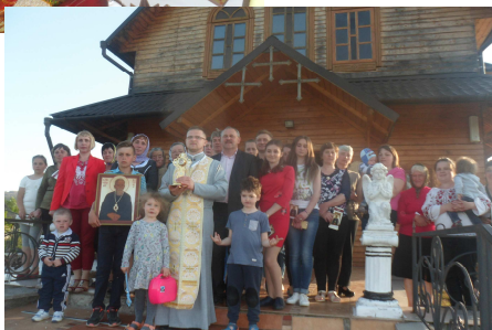
After a presentation at Holy Trinity Parish in Dolynivka