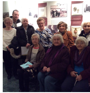
St. Joseph's Ukr. Cath. Seniors, Wpg