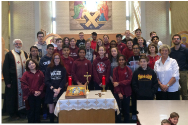
Grades 7 & 8 students from Christ the King School spend a day at the Shrine. As a project, they made rosaries from bread similar to what Bl. Vasyl made in prison.