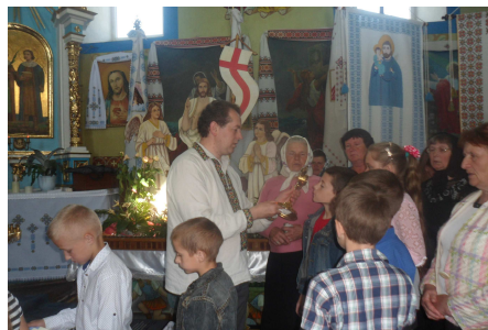
Venerating the relics in St. Cosmian & Damian Parish in Zastavne