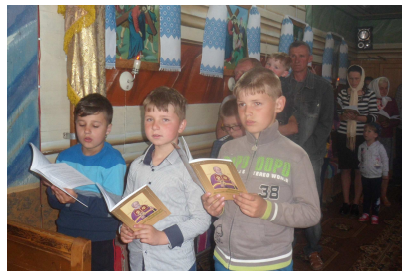
Praying the Acatist Hymn to Blessed Vasyl in Opavchik