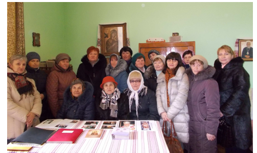
Parishioners from the Mother of God Parish in Davidiv