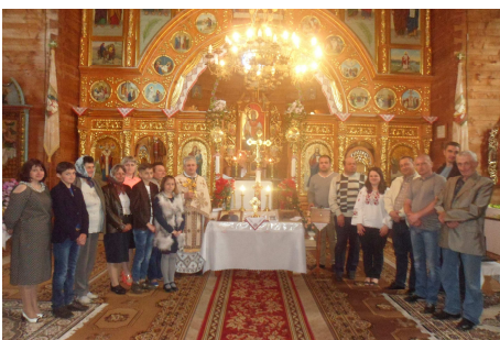
Parishioners from St. Michael's parish in Smozhe