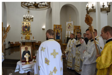
The 1st Class Relics are brought to the Kyivian Theological Seminary of the Three Holy Bishops