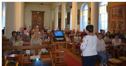
Presentation at the Cathedral of St. Volodymyr, Paris, France