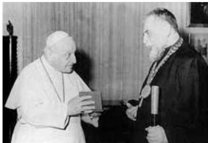
Metropolitan Josyf Slipyj meeting with Pope John XXIII upon his arrival in Rome for the Second Vatican Council

were that of government agents. The Metropolitan opened the door and the agents came in and took him to the