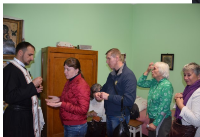
Blessed Vasyl's Holy Relics are brought to the Blessed Mykolay Charnetsky Parish in Semakivtsi - the birth place of Blessed Mykolay