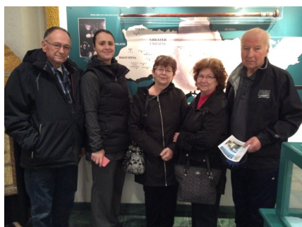
Visitors from Regina, SK & Winnipeg, MB