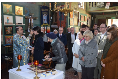
Presentation & anointing at the Church of the Nativity of the Mother of God, Lublin, Poland