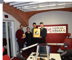
Participating in a Radio program about Blessed Vasyl in Lviv, Ukraine