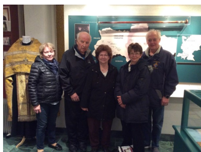
Visitors from Spruce Grove & Red Deer AB, & Winnipeg, MB