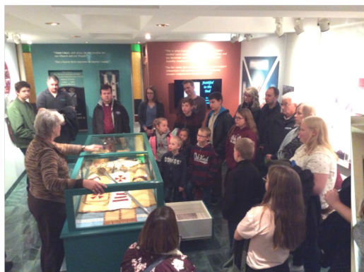
Resurrection Ukr. Cath. Parish Catechism Program, Dauphin MB