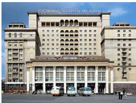
Hotel Moskva as it was in the 1960's where Blessed Vasyl was consecrated to the episcopacy. Recently renovated, it is now The Four Seasons Hotel

1962. Metropolitan Josyf Slipyj, head of the Ukrainian Greek Catholic Church was still living and imprisoned in laager camps in Siberia and Mordovia. On January 23, 1963, he was freed by Nikita Khrushchev's administration after political pressure from Pope John XXIII and United States President John F. Kennedy. Metropolitan Josyf spent 18 years imprisoned by the Soviet Un-