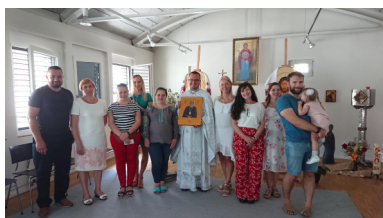
Holy Trinity Parish in Bern Switzerland