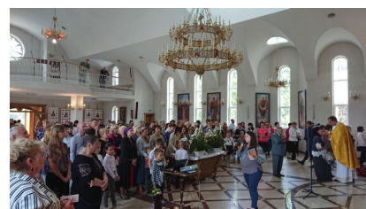
St. John the Baptist Parish in Lviv