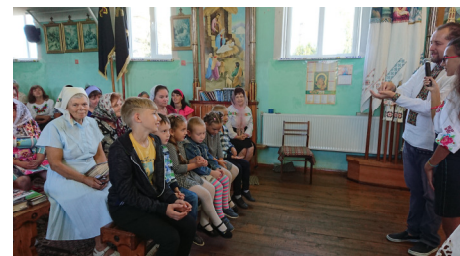
Children's presentation at Rozdolivka, Donetsk region