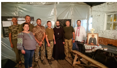
Near the war zone in Eastern Ukraine