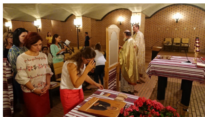
Presentation in Zurich, Switzerland