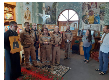
At the Kolomeya correctional institution