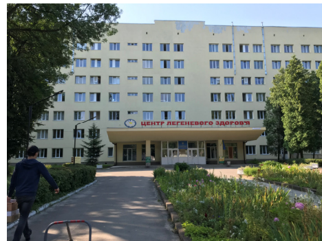
The main tuberculous and lung hospital

Upon arrival, we contacted Fr. Lohin who told us that Andriy needed to come the next day to the well-known tuberculosis