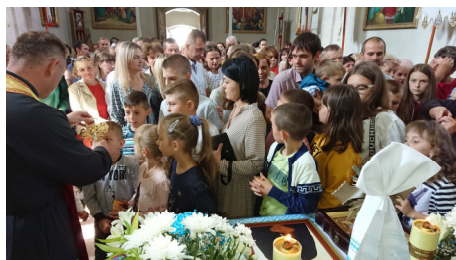
Venerating relics at Transfiguration Parish in Zboriv, Ukraine