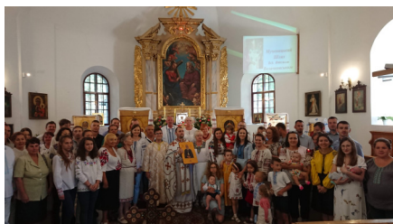
Dormition Parish, Rzeszow, Poland