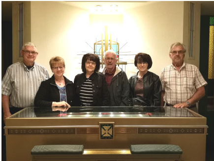
Visitors from Yorkton, SK attending the Blessed Vasyi feast day