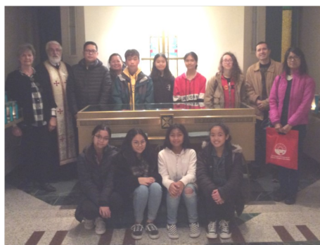
Catechism class from St. Mary's Cathedral, Winnipeg