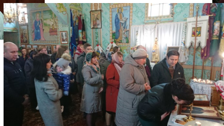
Parishioners venerating the relics of Blessed Vasyl in Holy Trinity Parish, Solone, Zalishchyke district