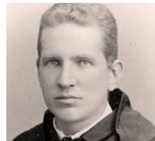
Father Andrey as a Basilian monk

born in 1865 into an aristocratic family, which at that time belonged to the Polish Roman Catholic Church. At a young age, Andrey heard the call to return to the church of his ancestors, the Ukrainian Greek Catholic Church. He joined the Reformed Basilian Order. After being their Novice Master and later Rector, he was called to become the Bishop of Stanislaviv on September 17, 1899. While he was the bishop of the city, Blessed Vasyl Velychkovsky's father was a priest catechist at the Cathedral. Bishop Andrey would become the Metropolitan of Lviv a year later. Three years later, Blessed Vasyl would be baptised in the Cathedral where Bishop Andrey served.