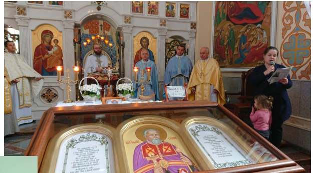
The relics of Blessed Vasyl brought and installed in Protection of the Mother of God Church in Zalishchyke