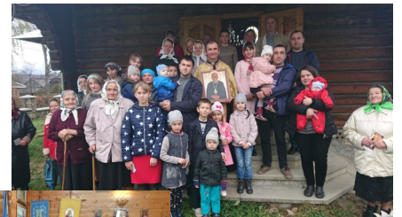
The Entrance of the Mother of God into the Temple Parish, Lyucky, Kosiv district