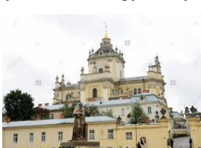
St. George's Cathedral in Lviv where Blessed Vasyl was ordained to the diaconate

After a retreat during his third year of theology, Vasyl made the decision to accept the