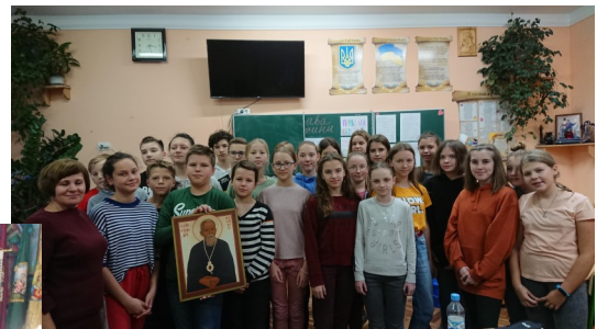
Grade 7 student from a Middle School in Lviv