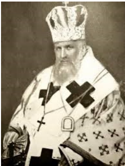
Metropolitan Andrey Sheptytsky 1865-1944

November 1, 2019, marked the 75 th Anniversary of the death of the Servant of God Metropolitan