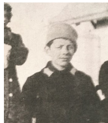
Blessed Vasyl as a young soldier

There are many intersections in Blessed Vasyl's life with that of the Metropolitan. Blessed Vasyl, at the tender age of 15, joined the Ukrainian Riflemen to fight off the Poles and the Russians. When he was 17, he was captured and told to dig his own grave. However, before he finished digging, the order was changed and he was taken to prison and labor camps. By God's grace, he es-