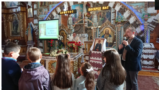
Presentation in the Dormition Church in the village of Seredniy Bereziv, Kosiv area