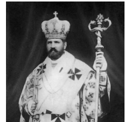
Metropolitan Andrey became Metropolitan at the age of 36.

Lviv Theological Institute to study for the priesthood. He chose the Lviv Seminary, because this seminary allowed married priests. He would not have considered himself a stellar student. He had trouble with Latin and spent considerable time downtown with his friends. When it came to his annual exams, he did poorly. They were oral exams taken before a group of professors at the Metropolitan's apartment with the Metropolitan himself the chairman. Young Professor Josyf Slipyj asked three questions and to each of Vasyl's responses, the professor said "Wrong". At the third response, the Metropolitan 'woke up' and asked for the questions and the responses to be repeated. This time after each response the Metropolitan said "Good". Thus Blessed Vasyl passed his exams. In his autobiography, Blessed Vasyl describes this event as such: "I don't remember, now, the questions and answers; but I am convinced that Father Professor was right, because I had not adequately mastered the subject. On the other hand, the Metropolitan had, in this case, acted gently, paternally, closing his eyes to the justice of the matter."