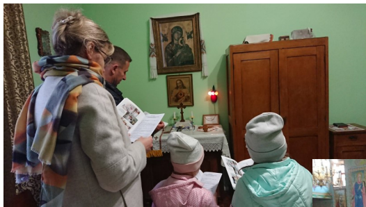
A family praying the Moleben Hymn in the Apartment/Museum of Blessed Vasyl in Lviv