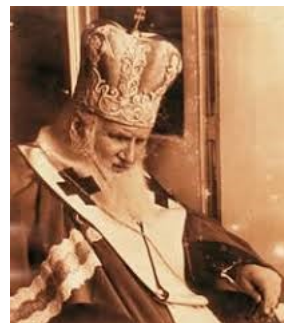
Venerable Andrey Sheptytsky in the latter years of his life

Metropolitan Andrey was considered even in his life-time to be a holy spiritual man of God. The Metropolitan is buried in the crypt of St. George's Cathedral in Lviv. His cause was opened in