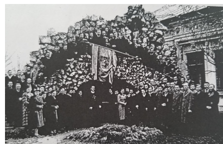
In 1940, Blessed Vasyl before the grotto in Stanislaviv about to begin a procession of 20,000 people through the streets of the city.

Vasyl's resolve began to be tested. In 1940, he was detained by the NKVD (Soviet secret police force) for a great procession through the city of Stanislaviv (now Ivano Frankivsk) in honour