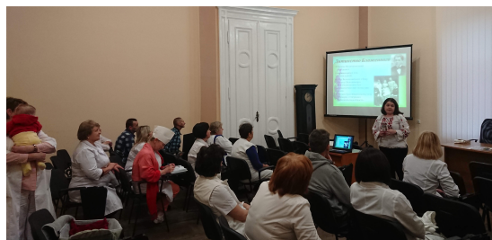
Medical staff from Zalisnychny Hospital in Lviv