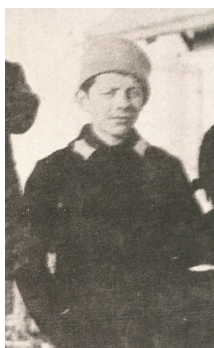
Blessed Vasyl as a young Ukrainian Rifleman (Sichovy)

Blessed Vasyl Velychkovsky lived mostly in the time of totalitarian regimes. He was born in Ukraine under the Austro-Hungarian Empire. This freedom, quickly came to an end when Blessed Vasyl found himself in World War I and the subsequent Polish-Ukrainian conflict. It is during this time that he joined the Ukrainian Riflemen to fight for the freedom of Ukraine against Polish aggression. Eastern and Central Ukraine at the same time fell to the Soviet Union. Under Polish rule, the Polish language and culture were forced upon the Ukrainians. Blessed Vasyl at that time studied theology at the Ukrainian Lviv seminary, one of the few schools of higher learning that was allowed to be in the Ukrainian language. He experienced this cultural and nationalistic persecution especially when he did pastoral and missionary work in Volyn. For this, he was chased out of Volyn and had to return to Halychyna (Western Ukraine), where he continued his missionary work.