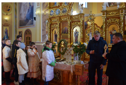
Nativity of the Mother of God Parish in Bilyi Oslavy, Nadhirna district,