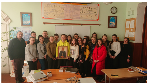
Grade 11 students from School #73 in Lviv