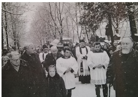
As a bishop, he led this funeral for a fellow Redemptorist, but being Ukrainian Catholic he could not wear priestly vestments.