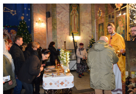
Inside the ancient church of Sts. Ser-

hearts. Both churches were crowded with parishioners, who came enthusiastically to learn about our Martyr. The parishes were grateful to have a 1st