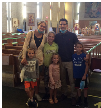
The Galle family from Thunder Bay, ON