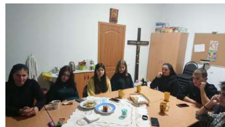
Light to the World Youth Organization at the parish of the Nativity of the Mother of God, Chernihiv