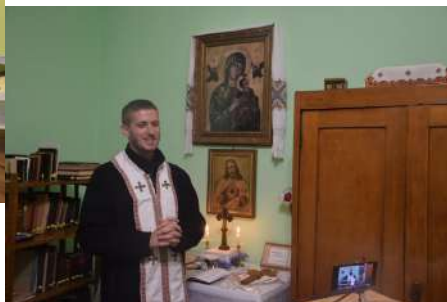
Moleben for teachers and student in Blessed Vasyl apartment/museum in Lviv