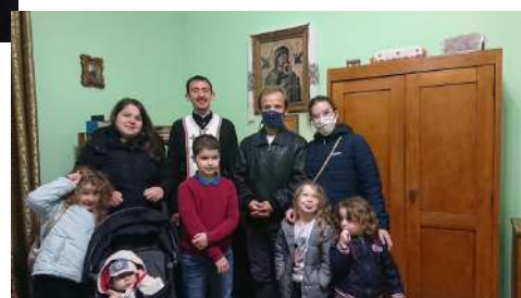
Filming of the Video Series on Blessed Vasyl's life