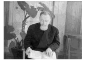
Blessed Vasyl giving a retreat during the underground church

During a retreat that Blessed Vasyl gave to priests in 1966 in the time of the persecution he said the following: