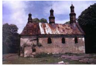
A church in Ukraine in ruins

returned from his imprisonment in Vorkuta. When he was arrested, others had already been arrested,