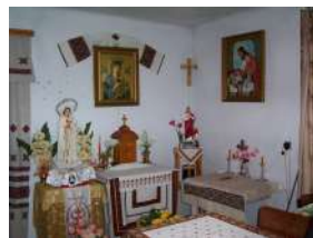
A secret underground chapel

ed, but the church was still functioning in a limited way. When he returned, all the churches had been confiscated. Some were passed over to the Russian Orthodox Church, but most of them were turned into other uses like an archives building, warehouses, restaurants, or simply abandoned and left in ruins. Some were simply demolished and destroyed altogether. When Blessed Vasyl saw this destruction of the Church he loved, he did not become despondent or just abandon this illegal church. Rather