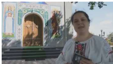
Filming of the Video Series on Blessed Vasyl's life done in Shuparka