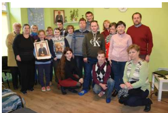
Presentation at Caritas, Lviv