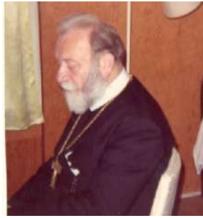
Blessed Vasyl in prayer

What a richness, what sweet happiness comes from a conversation with Jesus, with God through our interior life! Life with Jesus brings much sweetness and joy. On the contrary, how bitter and unbearable is life without Jesus. All earthly riches, in comparison with life with Jesus, are like poison. Thus, my dear brothers, we see the importance of the Kingdom of God within us and what is our interior life!"