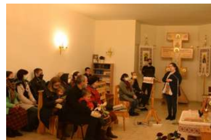
Presentation at the parish of the Nativity of the Mother of God, Chernihiv