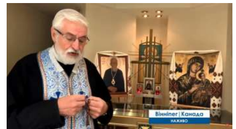
Praying the rosary live with thousands on Zhyva TV

We were honoured to participate in a daily rosary that was broadcast on a Catholic TV Station in Kyiv Ukraine. The TV station is Called Zhyve TV (Живе Телебачення) YouTube. This Station has been praying the Holy Rosary every evening at 8 pm Kyiv Time from a different church and place from all over the world. We were asked to lead the Rosary in Ukrainian on October 30th from the Shrine Chapel. There were over 8,000 participants with us through social media. The link to this rosary can be found on our website on the front page.