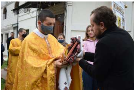
Presentation of the holy relics of Blessed Vasyl to the pastor in Chernihiv