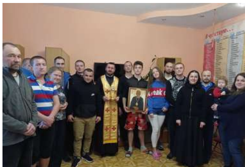
Light to the World Youth Organization at the parish of the Nativity of the Mother of God, Chernihiv