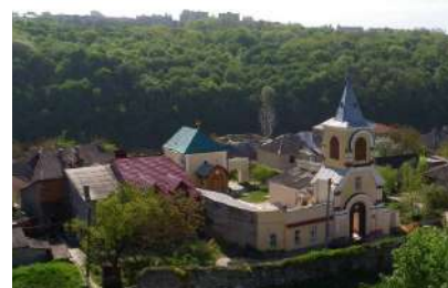
An aerial view of St. Nicholas Church together with the entrance and residence