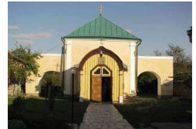
St Nicholas Church in Kamianets-Podilskyi

Finally, he arrived in the ancient city of Kamianets-Podilskyi. He was unaware that just before his arrival all the Jewish people of the city were executed by the Nazis. (During our 2018 pilgrimage to Ukraine, we came across the church where these people were executed and buried. The local people were just beginning to exhume the remains.) With the letter from the Metropolitan in hand, Blessed Vasyl went to the officials at city hall. They offered him a church of his choice. Blessed Vasyl chose the ancient church of St. Nicholas, built in 1398. The church had been abandoned and used as an automobile repair shop. When the people found out that a priest had arrived, they quickly cleaned the church and brought out the icons and the liturgical items that were