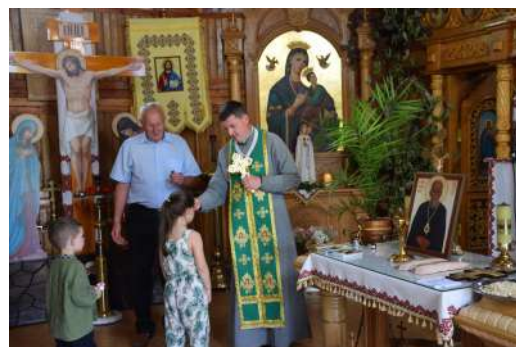
Ascension Parish, Chortkiv, Ternopil oblast