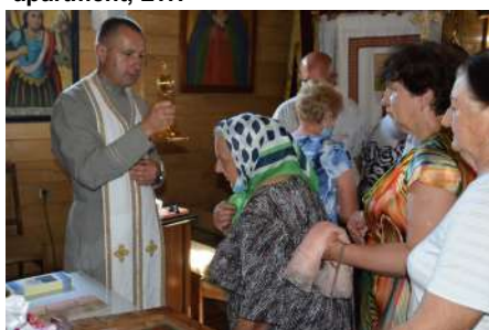
Kopychentsi, Chortkiv region, Ternopil oblast