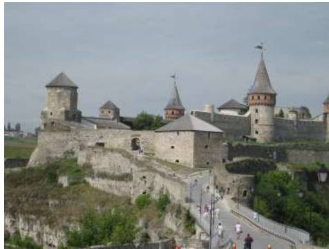
The ancient fortress in Kamianets-Podilskyi

With the Soviet Communists driven out of Central Ukraine by the Nazi, the people of that city wrote to Metropolitan Andriy Sheptytsky of Lviv to send them a priest. The Metropolitan asked Blessed Vasyl to go to Kamianets-Podilskyi and re-establish the Ukrainian Catholic Church.