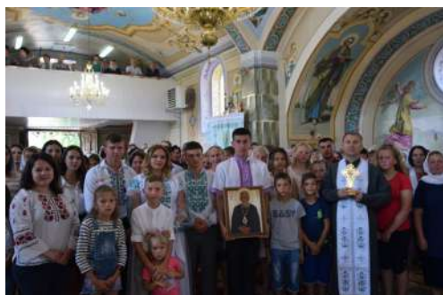
Holy Trinity Church, Nyzhbirok Novyi, Ternopil oblast,