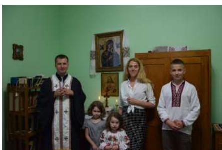
Acathist during the Feastday celebrations in Blessed Vasyl's museum-apartment, Lviv