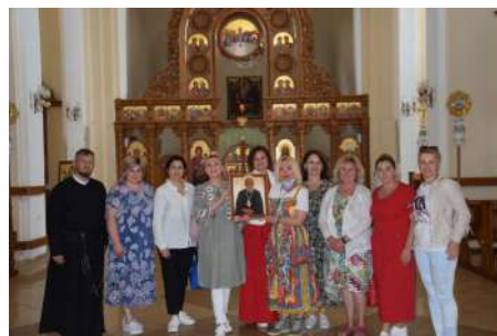
Pilgrimage group visiting the places where Blessed Vasyl spent his life In Ukraine