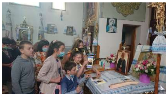
St. Demetrius Church, village of Myrtyuky, Stryi district, Lviv oblast