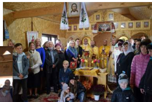
Blessed Vasyl Velychkovsky Parish in Kovel, Volynia