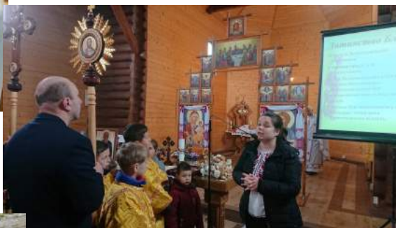
The Dormition of the Mother of God Parish, Pustomyty, Lviv oblast