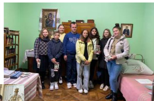
Students from the Nicholas Charnetsky Catechetical School in Lviv visiting the Blessed Velychkovsky museum/apartment