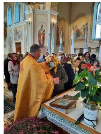
Village church in Ulashkivtsi, Ternopil oblast