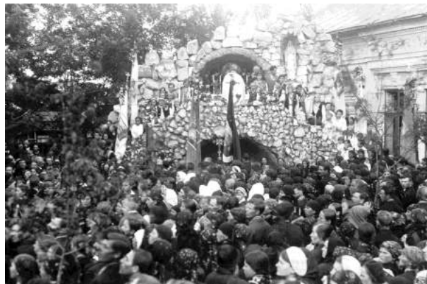
Celebrating Liturgy in the grotto at the Redemptorist monastery in Ivano-Frankivsk during the feast of our Mother of Perpetual Help

As a young Redemptorist, Blessed Vasyl was always eager to proclaim the Gospel, in particular during parish missions. A parish mission could last as long as ten days. He had many such missions in one year. From the interviews with eye-witnesses, the missions were crowded with people and they were moved to tears by his preaching. Some seventy years later people still