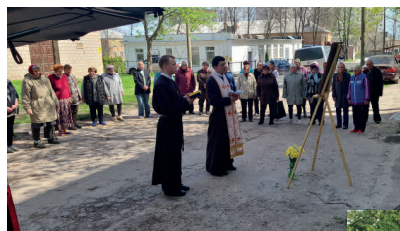
Redemptorists in Chernihiv, a city that was heavily shelled and destroyed, praying in the streets before the icon of our Mother of Perpetual Help.

sa continue to be at their posts serving their flock under the shelling and attacks of the Russians. Our confreres in Berdiansk find themselves in