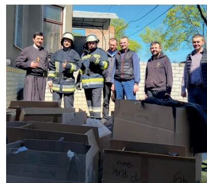
Redemptorists from Chernihiv providing humanitarian aid to the victims of the unjust war in Ukraine

a Russian controlled city where they serve the people through prayer and spiritual care. Our confreres in Chernihiv endured the shelling and the destruction of the city continuously serving the wounded, the displaced, burying those killed, feeding the hungry, providing clothes and medicines to those in need, offering the church and monastery as a place of prayer, comfort and safety to the people who have remained in that city. The other Redemptorist monasteries and churches, besides offering all the spiritual ministry, have become centers of humanitarian aid to all the victims of this unjust war of aggression. They imitate Blessed Vasyl's spirit and obtain inspiration from his example and his courage.