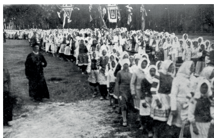
Religious Procession in 1940

During the Second World War Blessed Vasylychko was a priest. As a priest, he continued to do his priestly ministry despite the fact that the Soviets began to occupy Ukraine in late September 1939. With the Soviet occupation, began the persecution of the Church. Although the safer action would have been to cancel all public