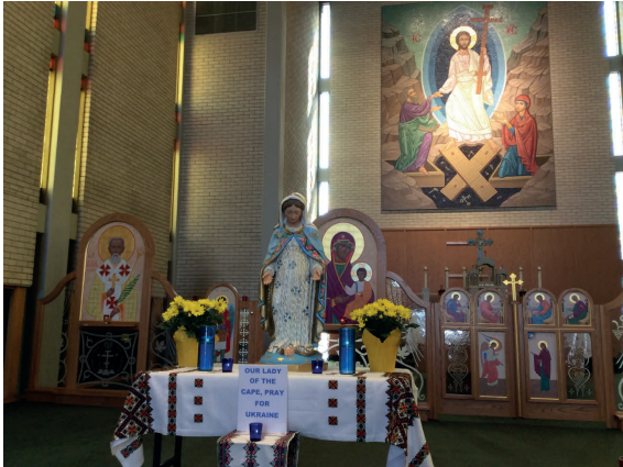
On May 3 & 4, the miraculous statute of Our Lady of the Cape, from Cape de Madeline, Quebec was present in our Shrine. Prayers were offered throughout both days for peace in Ukraine.