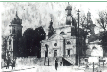
Redemptorist parish in Ternopil where Blessed Vasyl was superior

allowed after he was able to obtain train tickets. He entered the city when the shelling had already begun. He went back because there were people who could not leave; the elderly, the sick and the orphans. He went there to be with them, to suffer with