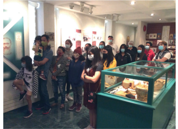
The Confirmation class (22) from Christ Our Saviour Catholic Parish in Steinbach spent a morning at the Shrine/Museum in preparation for their upcoming Sacrament of Confirmation.