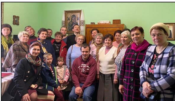
A group visiting the museum from St. Demetrius Parish, Lviv