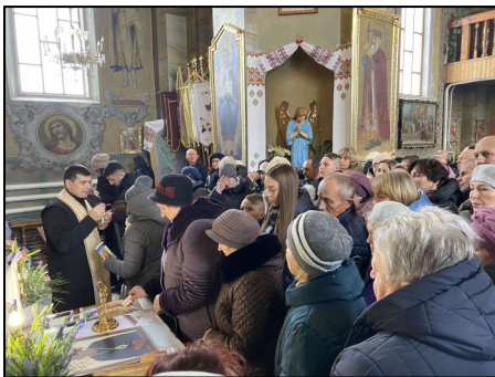
Presentation to the parish in Kozova

The ministry of promoting Blessed Vasyl in Ukraine continues even despite the horrors of war.