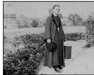
Blessed Vasyl arriving in Volyn

As a missionary priest, he shared in the poverty of the people of Volynia. Often, while he was on missions, he