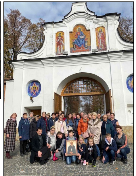
Pilgrimage to Krekhiv