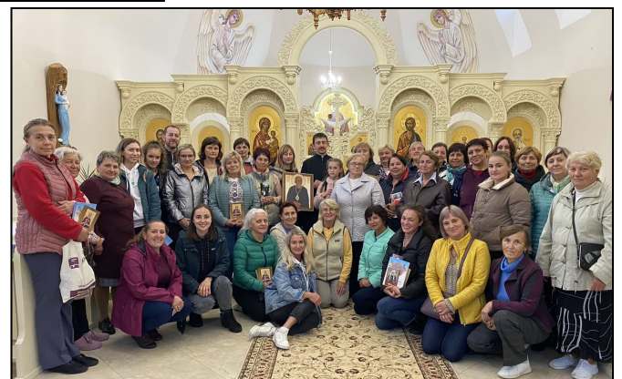
Pilgrimage to Zazdrist