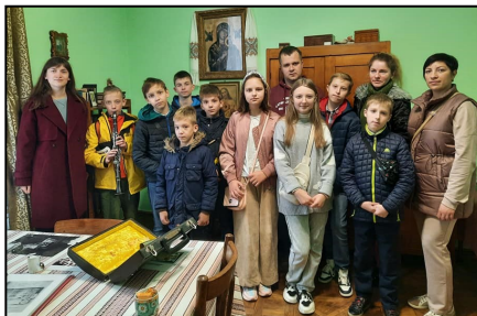
Children from St. Andrew's Parish, Lviv visiting the Museum