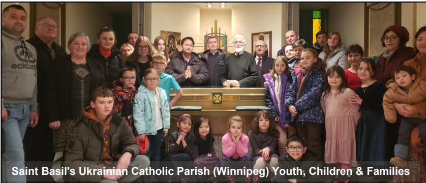
Saint Basil's Ukrainian Catholic Parish (Winnipeg) Youth, Children & Families

Thank you to all those who take time to visit the Museum and spend time in prayer before the Holy Relics of Blessed Vasyl. Here are only a few photos of some of the recent visitors