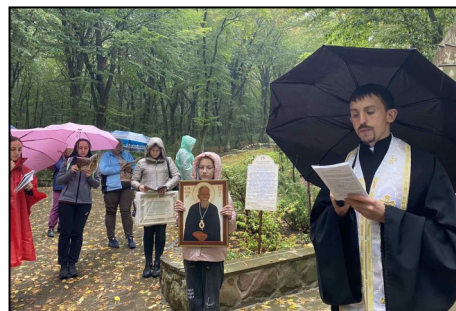
Pilgrimage to Zarvanytsia Way of the Cross