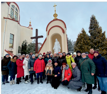
Pilgrimage to the Franciscan Church in Ternopil