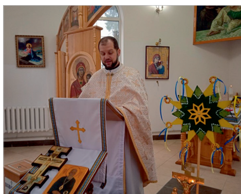
Lviv Prison Chapel