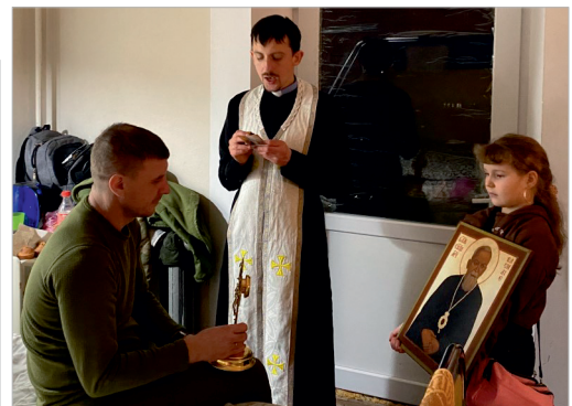
Ministry in a Military Hospital, Lviv