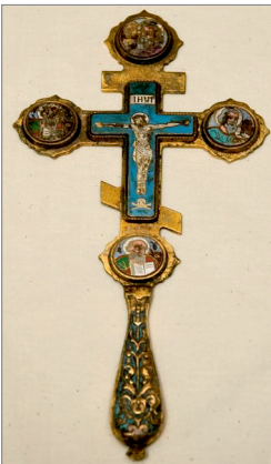
Cross that was buried with Blessed Vasyl

The war in Ukraine has now entered its second year. As the war continues, one can see an attitude change in the Ukrainian people. For the most part, they have become "acclimatized" to the terrors of war. Life continues, and they bear the dangers and unknowns of this war daily. A missile can strike anywhere and at any time. The people continue with their daily work amid the uncertainties of the time. The Ukrainian soldiers continue to lay their lives on the line to defend their homeland, not knowing if they will see tomorrow. They do this with conviction and with love for their country and the Ukrainian people. In some way, one can say that they are all carrying the cross daily, accepting their circumstances in life. They bear the cross of uncertainty and conflict that has been placed on their shoulders at this time of war. The people bury the dead and continue in the war effort in whatever way they can. The enemy cannot and will not break their spirit.