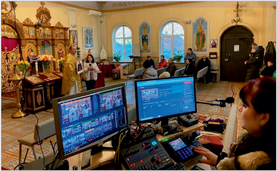
Presentation (that was also live-streamed to over 7,000 people) at the Protection of the Virgin Mary Church in Dnipro.