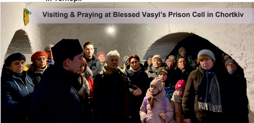
Visiting & Praying at Blessed Vasyl's Prison Cell in Chortkiv