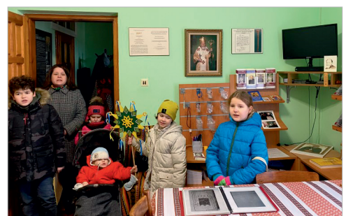
Young carolers bring greetings to the Museum/Apartment in Lviv