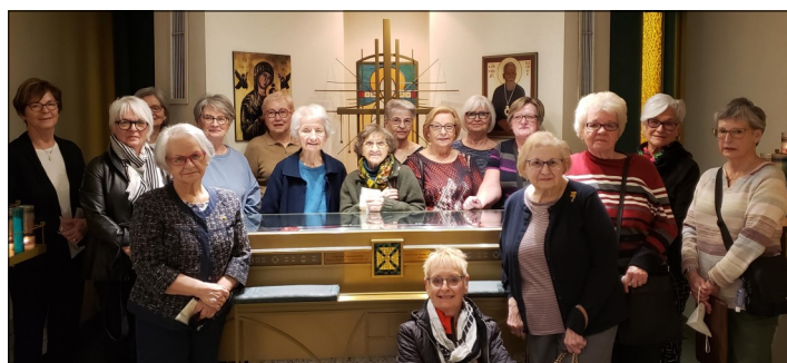
U.C.W.L.C.—St. Joseph's Branch Winnipeg