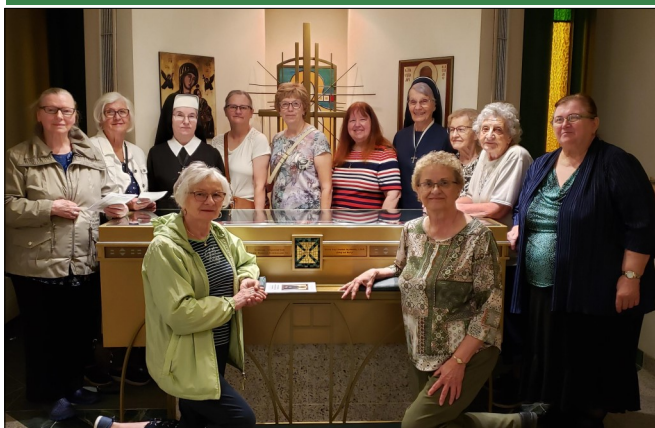
U.C.W.L.C.—Blessed Virgin Mary Branch Winnipeg