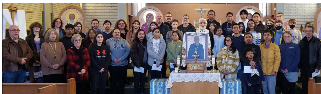
Saint John XXIII Church—Confirmation Class & Families Winnipeg