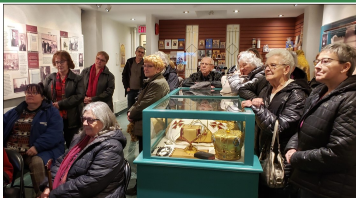
U.C.W.L.C.—Holy Eucharist Branch Winnipeg