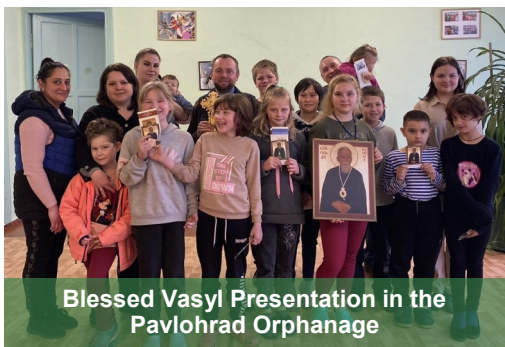
Blessed Vasyl Presentation in the Pavlohrad Orphanage