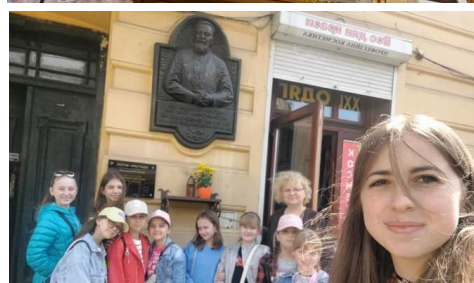
Children in Lviv visit Blessed Vasyl Museum/Apartment