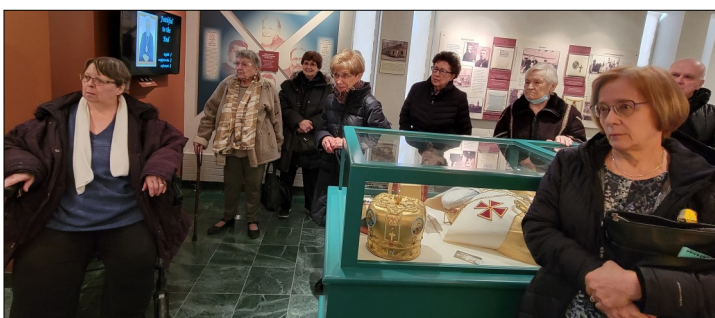
U.C.W.L.C.—St. Andrew's Branch Winnipeg