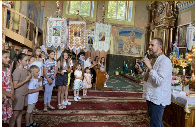
Butyny, r. Chervonohrad, obl. Lviv