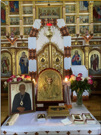
St. Nicholas Church Hamaliivka, obl. Lviv