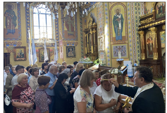
Cathedral of Sts. Peter & Paul, Sokal, obl. Lviv

The Shrine Staff in Ukraine continue to gather with the faithful in prayer and to share the story of Blessed Vasyl