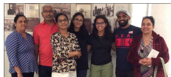
Group from Toronto & Detroit

Over the Summer Shrine Staff & Volunteers met visitors from Canada USA India Philippines Europe Ukraine