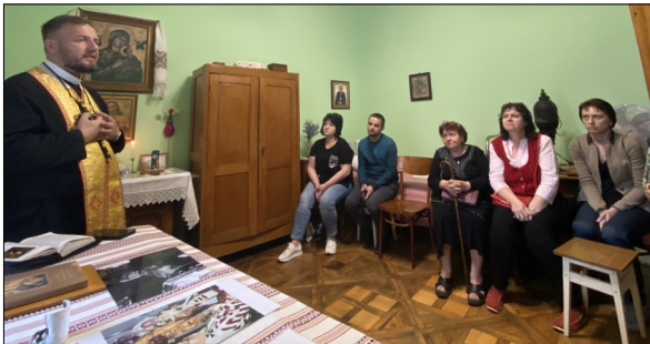
Mission in Blessed Vasyl Museum/Apartment, in Lviv

The Shrine Staff in Ukraine continue to gather with the faithful in prayer and to share the story of Blessed Vasyl