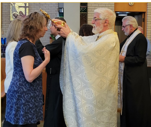
Veneration of the Holy Relics of Blessed Vasyl & Anointing with the Holy Oil