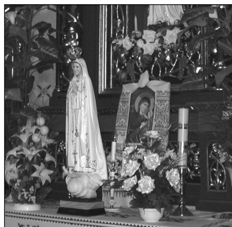
Altar of the Mother of God in Probizhnia, Blessed Vasyl's grandfather's church

Blessed Vasyl and other Redemptorists regularly visited villages and towns, going to areas where the need was the greatest. He already showed signs of being a great missionary, and was beloved by the people. Through his deep faith, conviction to Christ, dedication to the Mother of God and God's guidance, entire families, villages and towns were brought back to the Ukrainian Greek Catholic Church. Being a missionary, bringing the Word of God, giving messages of hope to those in great need was evident throughout Blessed Vasyl's life.