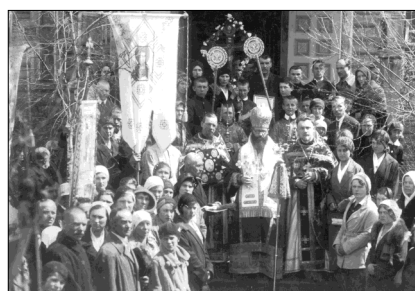
Easter Celebration in Kovel, May 1932

As a young Redemptorist priest, he was assigned as a missionary in the Volyn region of Ukraine. He served the people who moved there from Western Ukraine after World War I, scattered in various colonies. They were abandoned and in need of spiritual nourishment. He also ministered to the Orthodox, whose grandparents and great grandparents were once united to the Catholic Church and were forced into Orthodoxy.