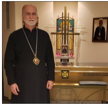
Archbishop Borys Gudziak of the Ukrainian Catholic Archeparchy of Philadelphia