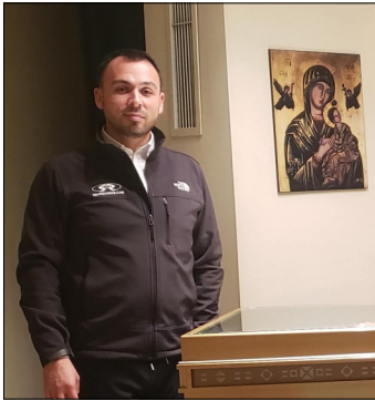
Archdeacon Nazar Yaruniv, Ukraine