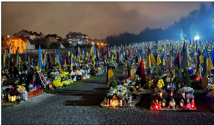
Cemetery in Lviv

the mothers who lost their sons. One mentioned to us that her son before he died said: "Mother don't cry. I have fulfilled my life by dying for freedom and for our country, so that my nine month old son could live in a free country."