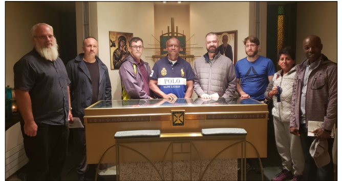
Canadian Military Chaplains