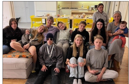
Live-in community at the Home for Girls in honour of Blessed Vasyl Velychkovsky in Lviv