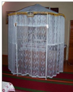
House and enclosed Altar area within the home where the ordination took place

Each day throughout his life, Blessed Vasyl embraced his cross, choosing to follow Christ, even to the point of death. His unshakeable faith was rooted in constant prayer. He recognized Christ within those he encountered. He focused on ways to bring hope and salvation to those in need.