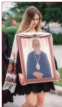
Pilgrimage Rosary Walk 2023

Start planning your pilgrimage today to be a part of this annual event.