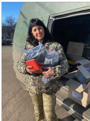
Medic Friend on the Front Lines