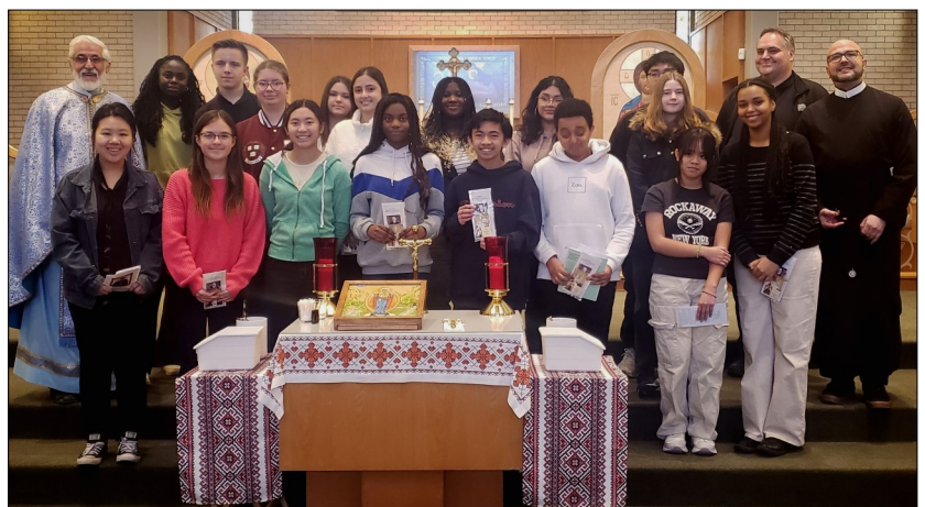
St. Boniface Diocesan High School Campus Ministry Team (Winnipeg, MB)