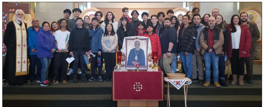
Christ our Saviour Catholic Church (Steinbach, MB) Confirmation Class, Teachers & Parents