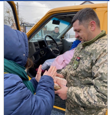
Giving 3 rd Class Relics to the Front Line

Please pray for the people of Ukraine and for an end to this war. Blessed Vasyl intercede for us!