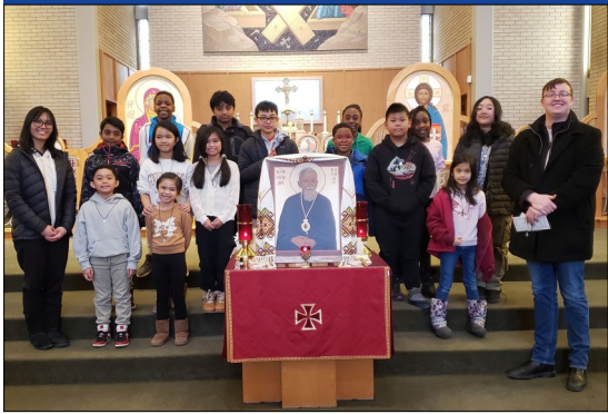
Christ the King Catholic Church (Winnipeg, MB) 1st Communion Class