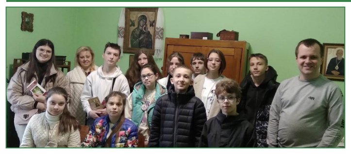
Catechism students from Blessed Mykola Tsegelsky School Church of the Resurrection , Lviv