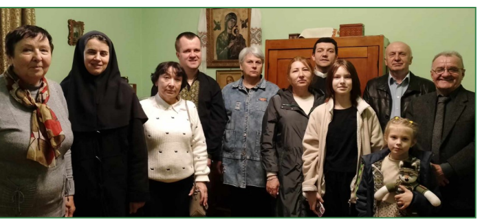
Visitors to Blessed Vasyl's Apartment-Museum