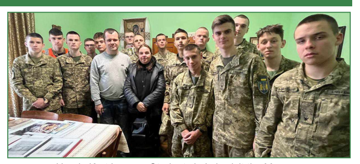
Heroiv Krut Lyceum Students in Lviv visit the Museum