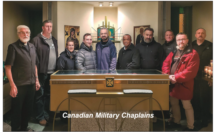
Canadian Military Chaplains