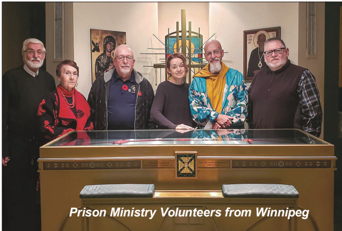
Prison Ministry Volunteers from Winnipeg