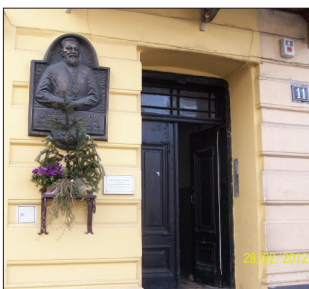
Entrance to his apartment