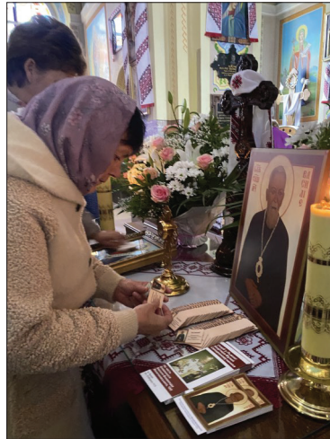
Hrushiv, Drohobych district