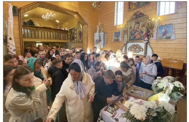
Church of St. Nicholas in the village of Pidluby, Yavoriv district. Lviv region