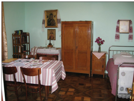
Blessed Vasyl's apartment today