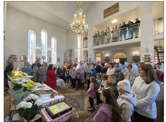
Presentation at the Church of St. Nicholas in Berdykhiv, Yavoriv district. Lviv region