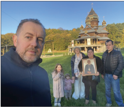
Museum staff visit Rohatyn, in Ivano-Frankivsk Oblast in western Ukraine

The van has been purchased. However, we still need more help to reach our financial goal.