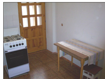
Apartment kitchen today