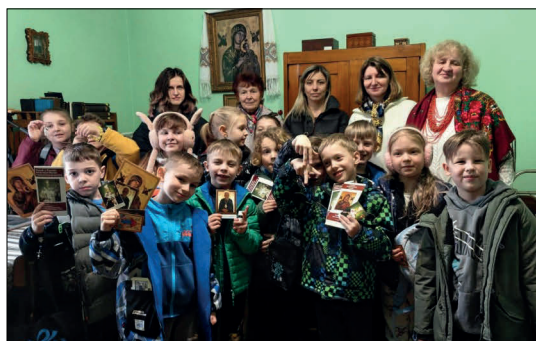
Students visit the Blessed Vasyl Apartment/Museum in Lviv, Ukraine