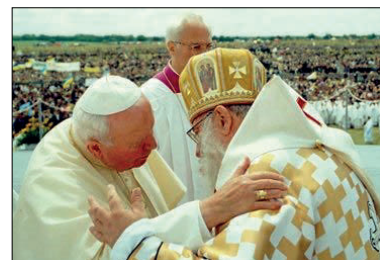
Pope John Paul II with Patriarch Lubomyr Husar