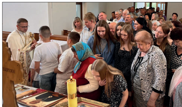
Presentations in the Drohobych Region