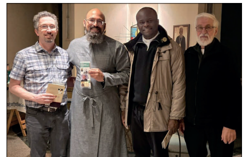
Delegates from the meeting of the Evangelical-Catholic Dialogue of Canada