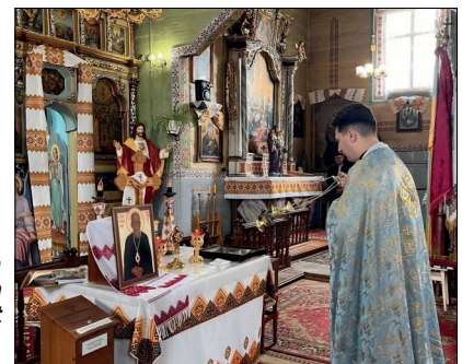
Presentation in Deliatyn Nadrivna Region Ivano-Frankivsk Oblast