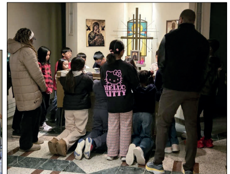
Christ the King Catholic Parish 1st Communion Class